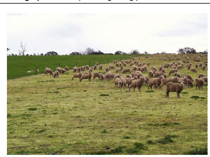
Photograph 1: Example of a grazing practice in the Boorowa district, Central West NSW.

Property Size: 1200 Ha Number of Paddocks: 110 This Paddock: 8 Ha