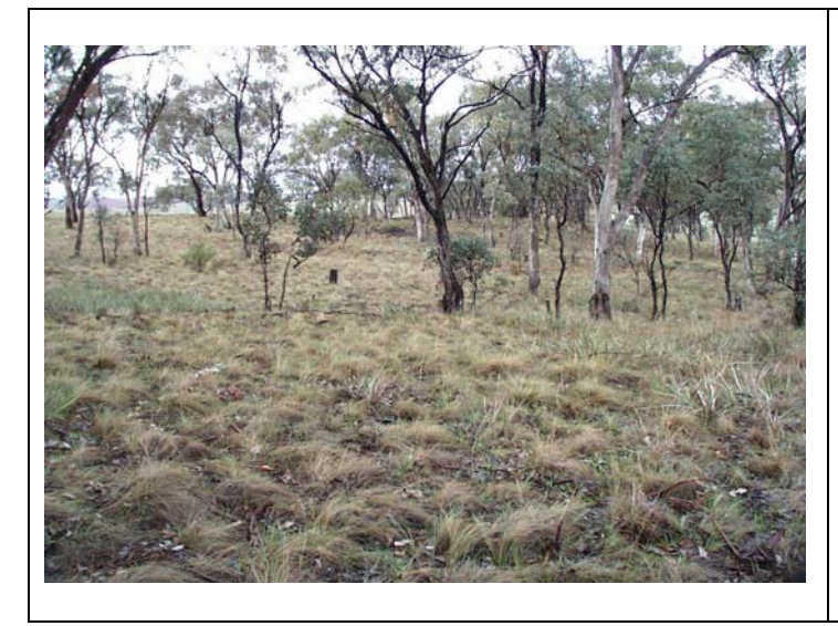
Photograph 2: Example of "white box" woodland in the Cowra district, Central West NSW

<u>Vegetation Species Assessment</u> – phalaris, tall fescue, chicory, redgrass, Microlaena sp., wallaby grass, balancia clover and white clover.