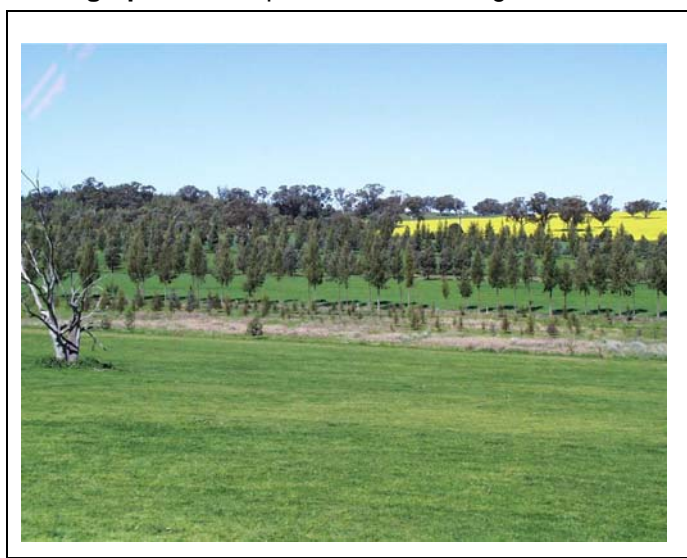
Photograph 3: Example of mixed farming north of Cowra, Central West NSW

Property Size: 840 Ha Number of Paddocks: 78 This Paddock: 33 Ha