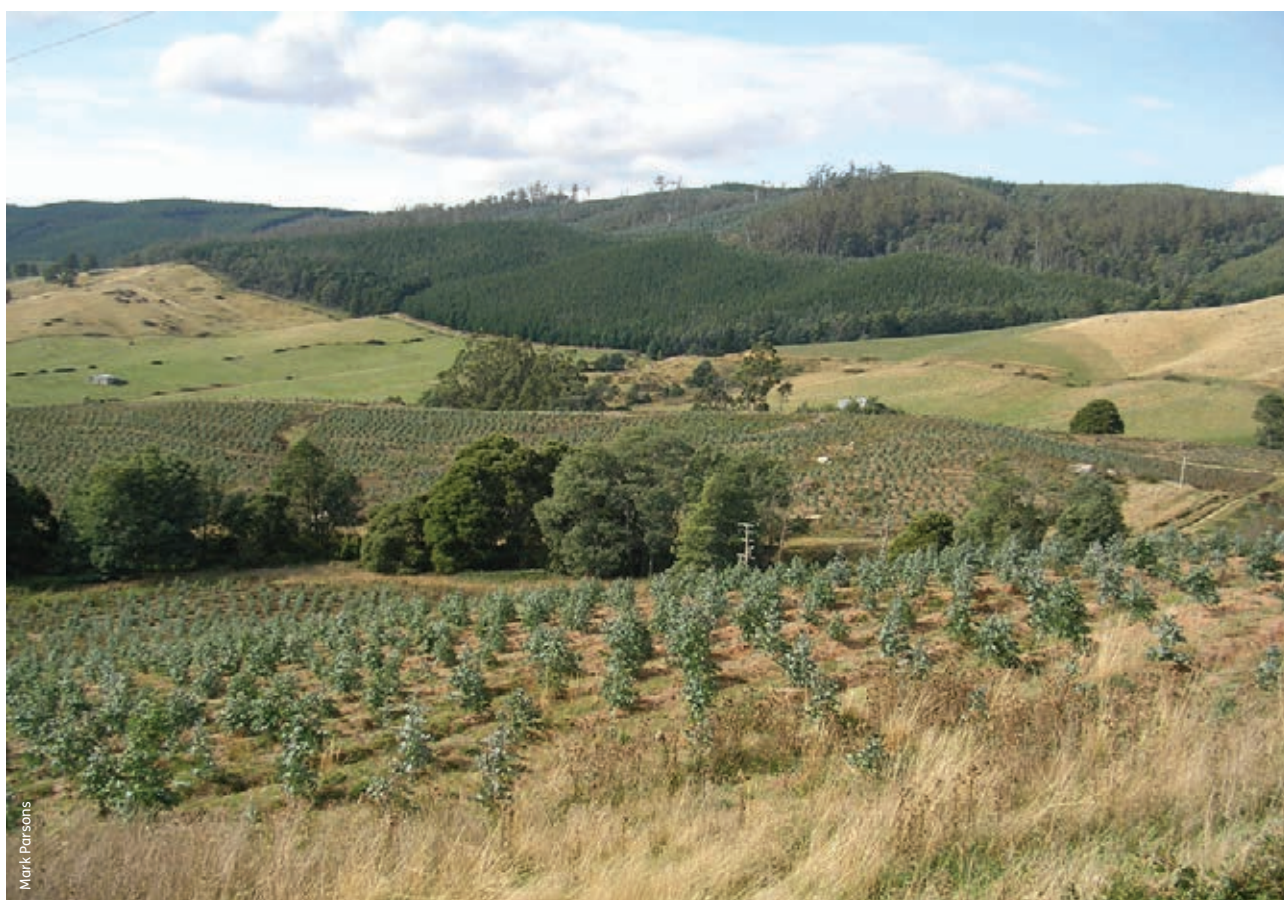
Plantations in Tasmania.