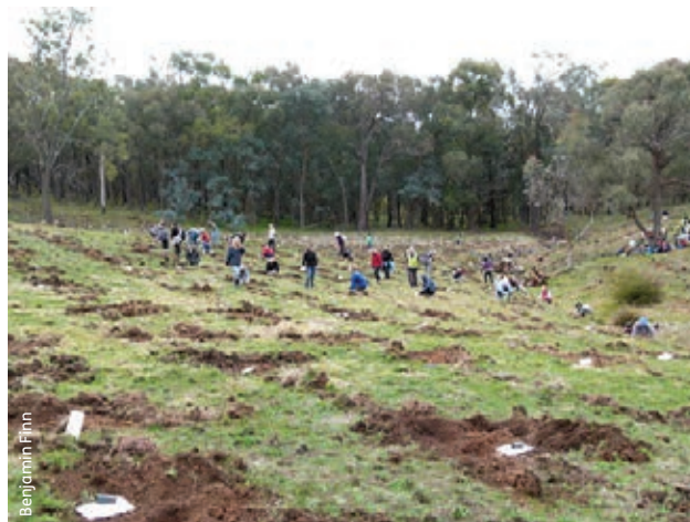
Environmental tree planting by a community group to protect a creek line and provide habitat for the endangered regent honeyeater ( Anthochaera phrygia ), Benalla, Victoria.

For example, during the five-year period to 2010, the national environmental organisation Greening Australia planted more than 15.5 million seedlings, direct-seeded 19 thousand kilometres of tree line, collected 18,250 kilograms of native seed, conserved more than 340 thousand hectares of native vegetation (including forest and non-forest areas) and constructed more than 8 thousand kilometres of protective fencing.