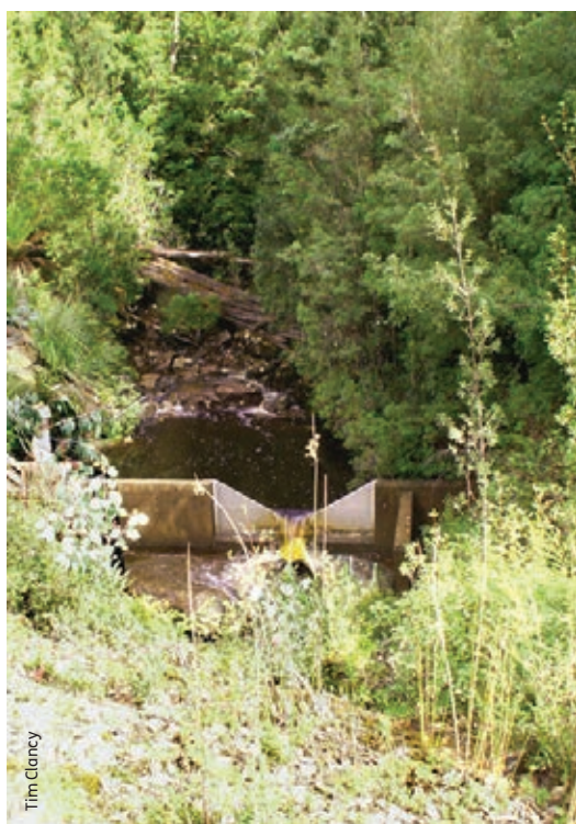
A water gauge, used to monitor stream flow from a forested water-course, Tasmania.

The Tasmanian Department of Primary Industries, Parks, Water and Environment maintains an extensive water quality and river health monitoring network in major rural catchments. Water quality is regularly monitored at 52 sites for a range of nutrients, turbidity, dissolved oxygen and pesticides, and river health is monitored at 60 sites. Floodwaters are also tested for a range of pesticides in four catchments with significant forestry activities.