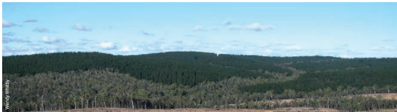
Native forest protecting a riparian zone in a softwood plantation in southern New South Wales.