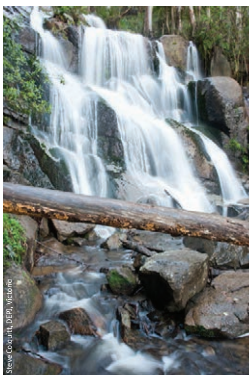
Toorong Falls on the Toorong River, managed production forest, Gippsland, Victoria.