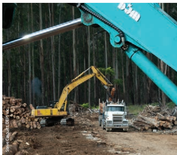
A log landing prepared to protect soil values during harvesting activities, Gippsland, Victoria.

Forests NSW 101 has a comprehensive soil assessment program for forestry operations, consisting of four modules: inherent soil erosion and water pollution assessment, mass movement assessment, dispersibility assessment, and seasonality. Forests NSW is required to apply all four assessment modules during a pre-operational planning phase, which precedes commencement of any forestry activities.