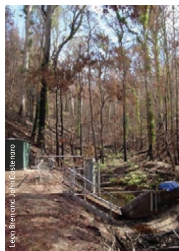
A research weir in a forested catchment (Clem Creek, Victoria), shortly after a fire event.

and these maps must be considered when planning the use of heavy machinery during firefighting operations. Although effects are much greater for intense fires, low-intensity fires such as prescribed burns can also increase the risk of erosion, particularly on erodible soils, where terrain is steep, or when there are subsequent, intense rain events.