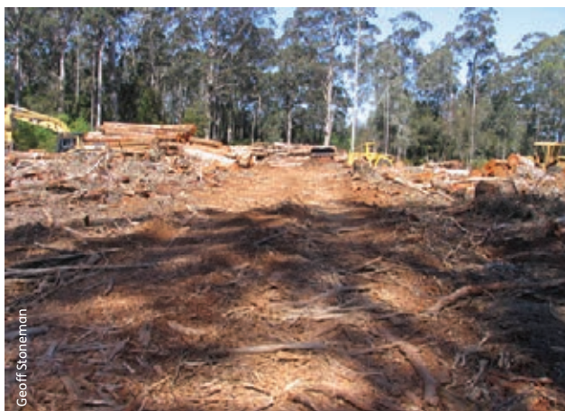
Bark and branches being used as brush matting at a log landing to protect the soil from vehicle tyres.

of the codes of practice are that the extraction of logs is to be carried out in a manner and by methods that do not result in significant soil disturbance. Consequently, any potential damage is mitigated. In addition, damage caused by the operation, including damage to soil physical properties, is to be repaired. Aspects that are covered in codes of forest practice include assessment and management of soil compaction, mitigating soil movement, creation and management of filter strips or buffers, and consideration of appropriate machinery to protect soil physical properties.