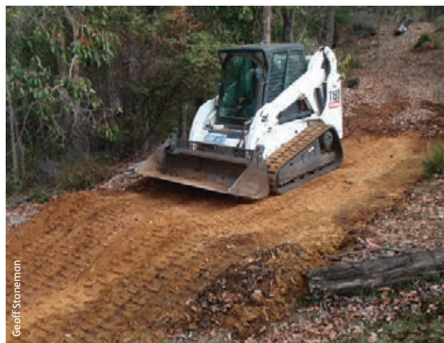
Rolling dip construction, south-west Western Australia. Rolling dips divert water off roadways and reduce the risk of soil erosion.

Knowledge of risks to soil properties is progressively incorporated into appropriate state and territory legally and non-legally binding instruments, and disseminated to the industry in various ways. For example, in Tasmania, dissemination of knowledge occurs through the Forest Practices Authority, which provides landowners and managers with access to soil management resource materials, including manuals and fact sheets. Combined with ongoing research and training and the experience of forest managers, these