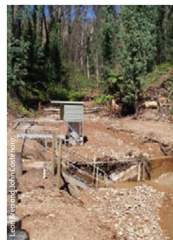
The same research weir two years post-fire, showing siltation and soil movement after rain.