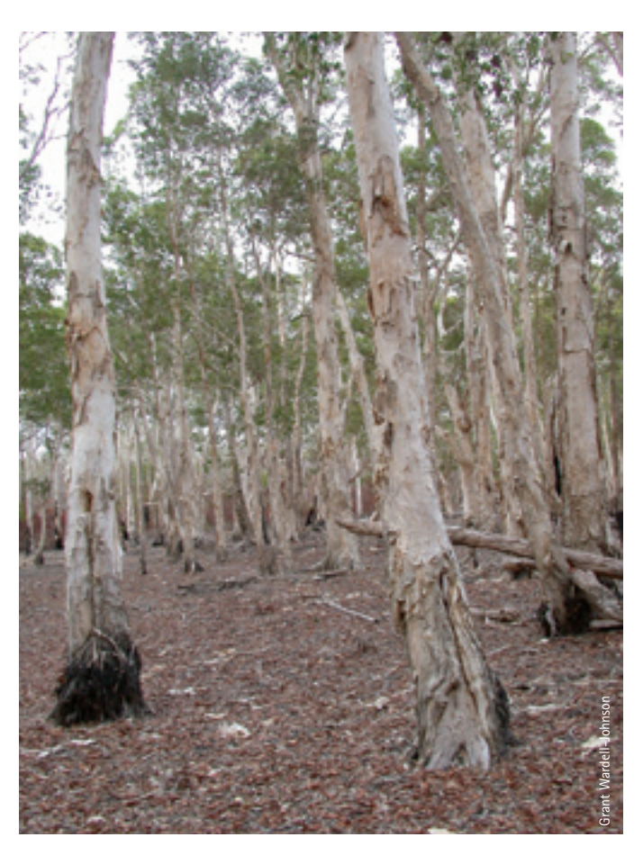
Seasonally waterlogged stand of Melaleuca leucadendra near Lockhart River, Cape York.

Indigenous Australians living traditionally in parts of the Northern Territory use the bark of long-leaved paperbark for making sheaths for stone knives and spearheads, as tinder for starting fires, a cover for baking food, a component of fish traps, and a material for making blankets or capes. As the only large diameter trees in the north, melaleuca trees can also be used to make canoes. The flowers can be sucked for nectar, or soaked in water to make a sweet drink.