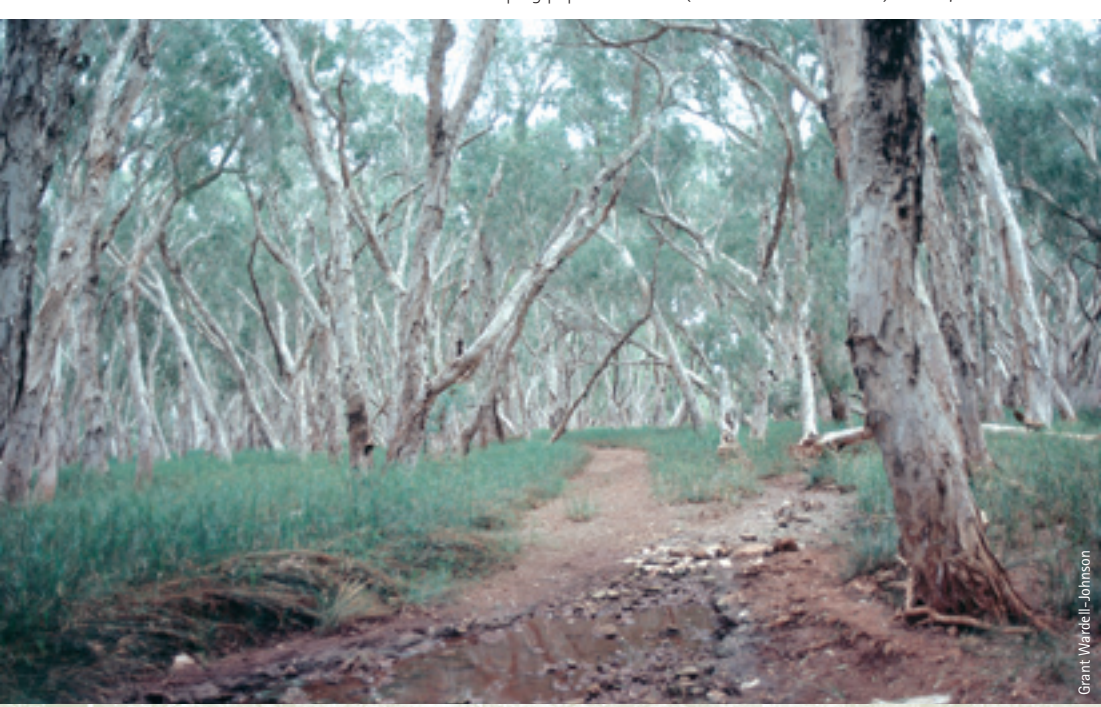
Weeping paperbark forest (Melaleuca leucadendra) Pilbara, Western Australia

The leaves of some melaleucas, particularly tea-tree ( Melaleuca alternifolia ), supply the raw material for the tea-tree oil industry. The oil is an effective antiseptic, and is used in creams for cuts and abrasions, shampoos, soaps, mouthwashes and toothpastes. Trees were harvested from natural forests until plantation development in the 1980s. Paperbark is also used in the horticultural industry as a lining for hanging baskets. Melaleuca flowers are important for apiarists as a source of honey, and are sometimes known as 'honey myrtles' for this reason.