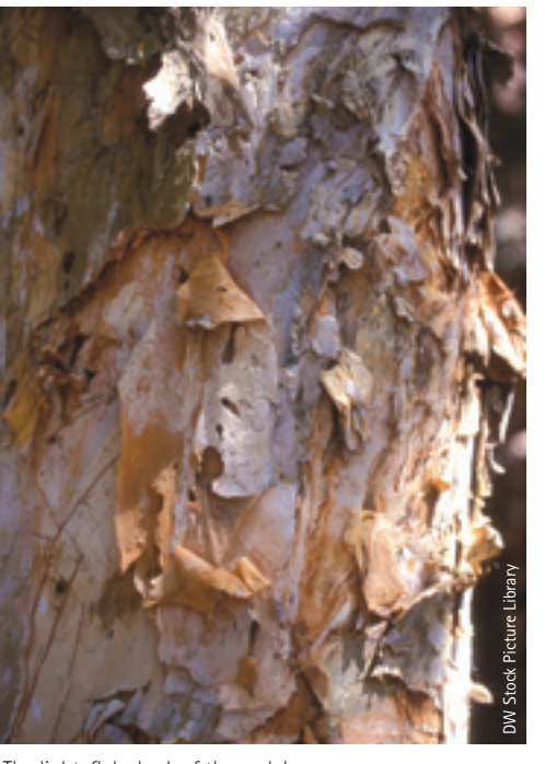
The light, flaky bark of the melaleuca