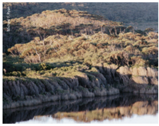
Coastal tea-tree (Leptospermum laevigatum) and eucalypt forest

In southern and eastern Australia, melaleuca forests are confined to more permanently wet watercourses and swamps. The most common coastal species is paperbarked tea-tree ( M. quinquenervia ). In Western Australia, melaleuca forests are restricted to small pockets in specific sites, such as Preiss's paperbark ( M. preissiana ) in nearcoastal swampy areas, and freshwater or swamp paperbark ( M. rhaphiophylla ) on creek lines and watercourses.