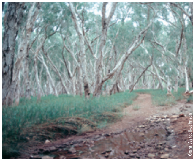
Weeping paperbark (Melaleuca leucadendra) Pilbara, Western Australia

The name 'melaleuca' comes from the Greek melas (meaning black) and leucon (meaning white). This referred to the first named tree, which had white papery bark over an inner layer of black bark, or to a tree with white bark that was burnt around the base of the trunk. Another commonly used name for melaleuca is 'tea-tree', although this term applies more often to Leptospermum species.