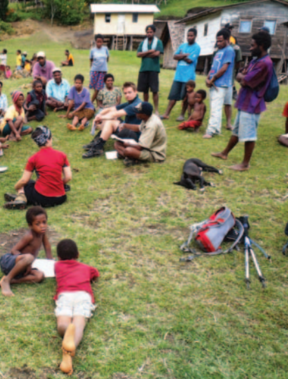
Livelihoods Community Consultation meeting at Alola February 2011