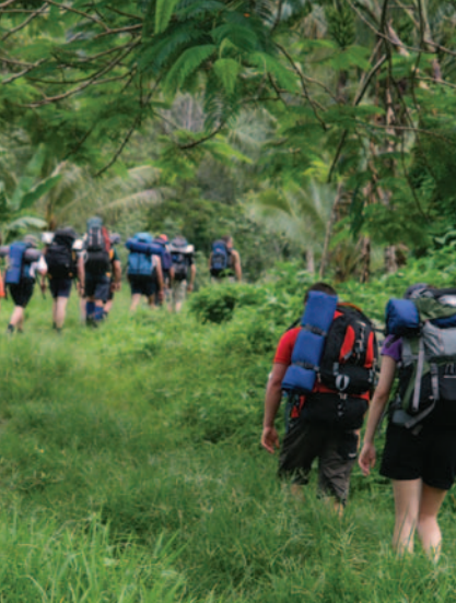
Kovelo Village.