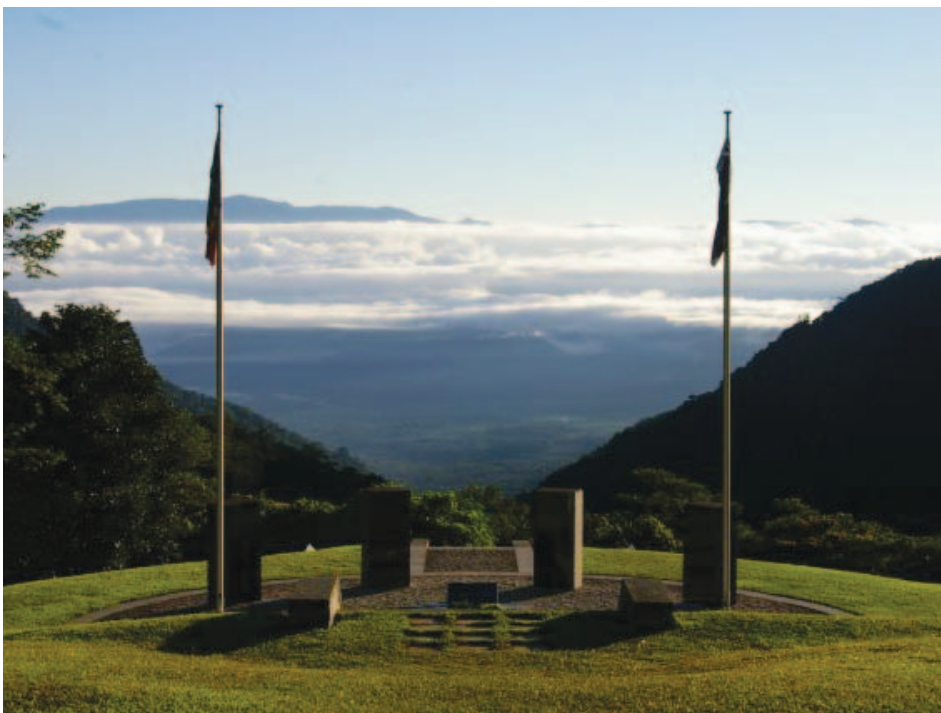
Isurava Memorial.