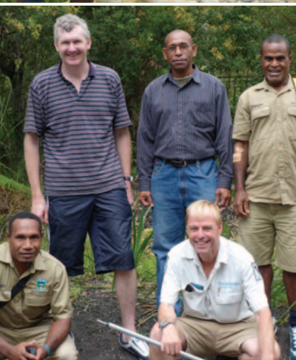
Top: Safety Package works at Kokoda Airstrip.