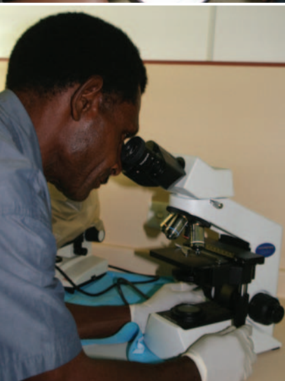
Top: Students at Kovel Elementary School Bottom: Health Lab