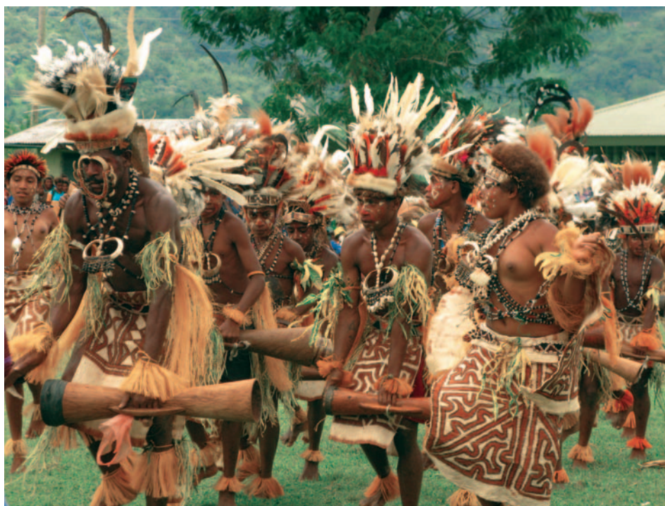
Fuzzy Wuzzy Angel Day.