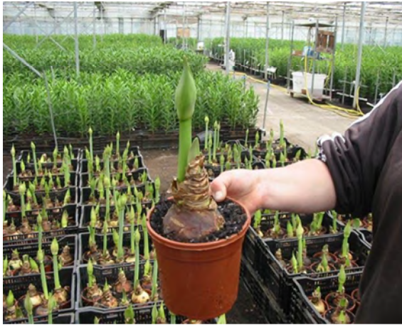
Figure B6 Hippeastrum plants with sufficient growth to inspect for release; the plants have formed flower heads with colour and are beginning to open. If foliage appears first, multiple leaves must be open and green before plants can be inspected.