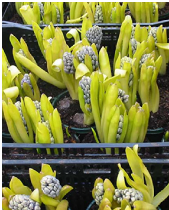
Figure B4 Hyacinth plants that have sufficient growth to inspect for release; the plants have multiple green, open leaves plants and formed flower heads.