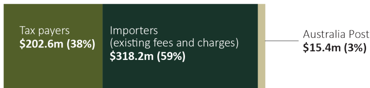
(b) Biosecurity funding with Budget measures