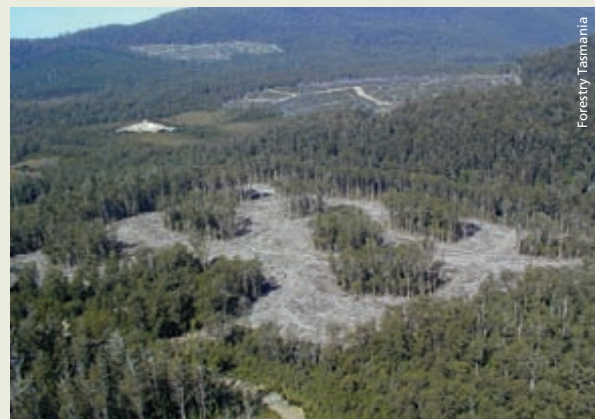
As a result of research undertaken at Warra in the Silvicultural Systems Trial, variable retention silviculture has been applied operationally in other locations in Tasmania, here contrasted with clear-felled coupes in the background.