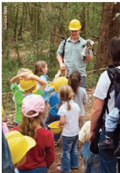
Mini-rangers participating in a school holiday trekking program.

Information on the Australian Government's policy on illegal logging is available at www.daff.gov.au/forestry/international/illegal-logging