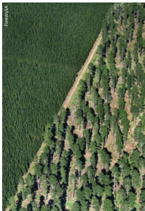
Pine plantation, ForestrySA's Kuitpo Forest Reserve, certified under the Australian Forest Certification Scheme.