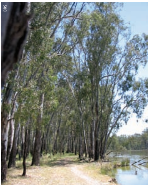
The red gum forests of the Barmah region are a significant ecological asset on the Murray River. Their good health relies on an adequate allocation of water to environmental flows in a highly regulated river system.