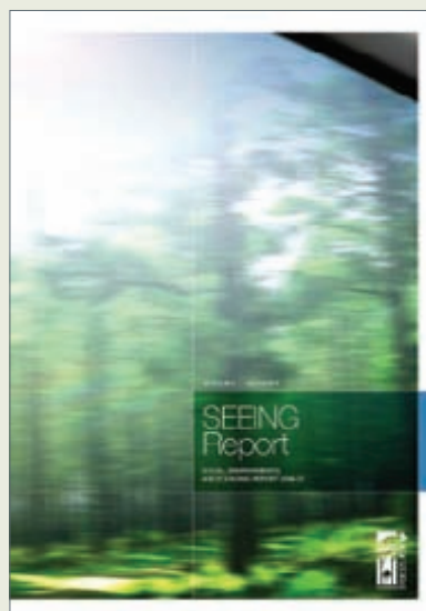
Figure 96: Reporting processes served by the SEEDS database of Forests NSW