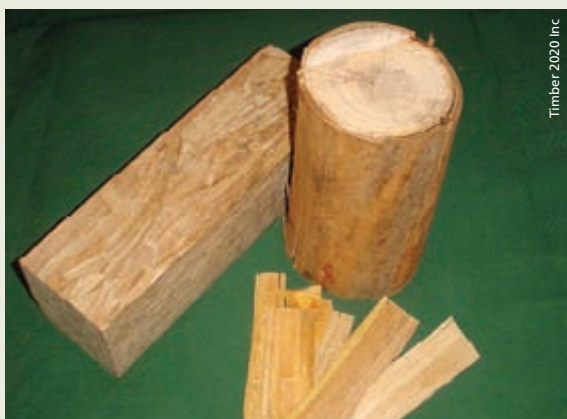
A plantation hardwood log is reduced to strands which are mixed with resin and compressed under heat and pressure to produce lumber.

Other examples of new technologies in the forest industry include the use of soundwaves to measure timber stiffness in stress-grading machines and new, environmentally friendly, timber preservatives.