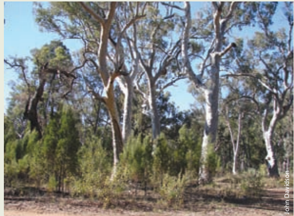
Eucalypt-cypress pine forest in the Brigalow Belt South region.