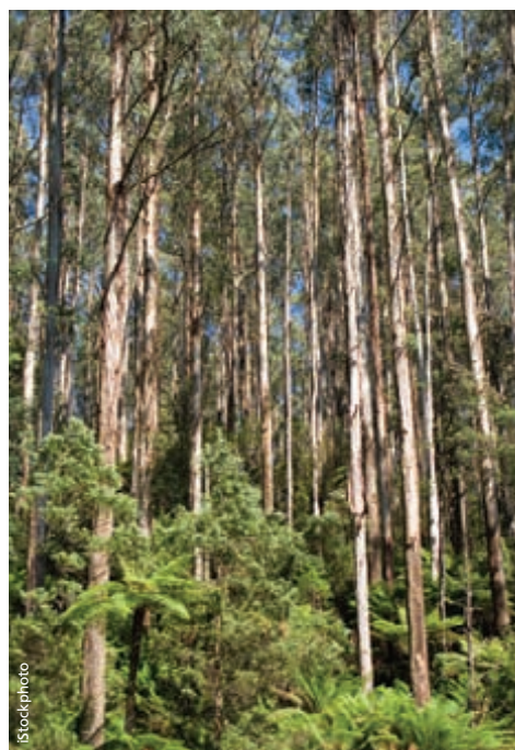
Tall eucalypt forest, Victoria.

Warra Long-term Ecological Research Site website: www.warra.com