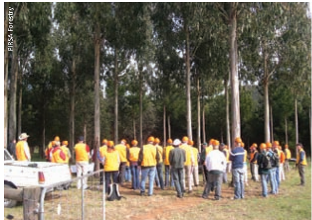
Field days are opportunities for growers to observe the application of new technologies and practices.

Commonwealth of Australia (1992, 2002, 2005b), Forestry Tasmania (2007) (list at the back of the report).