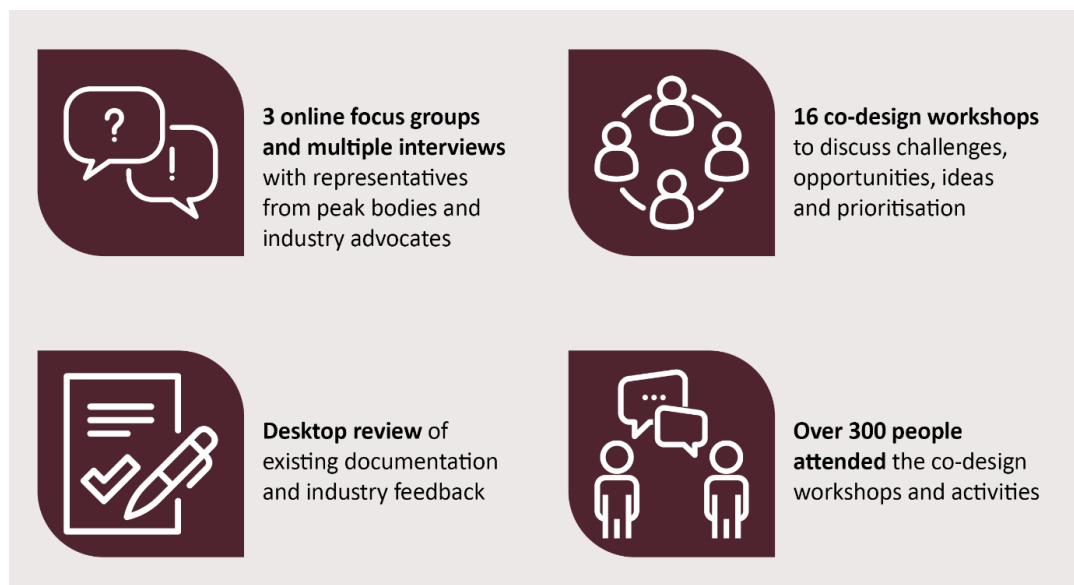
Figure 2 – Co-design activities at a glance

Beyond the targeted interviews and online focus groups, co-design workshops were held in Albany, Boyanup, Cranbrook, Darkan, Esperance, Fremantle, Kojonup, Lake Grace, Merredin, Moora, Narrogin, Perth and York. These discussions brought together a diverse range of expertise from the sheep industry – including producers and community representatives – and generated many ideas to enhance confidence and profitability across the supply chain.