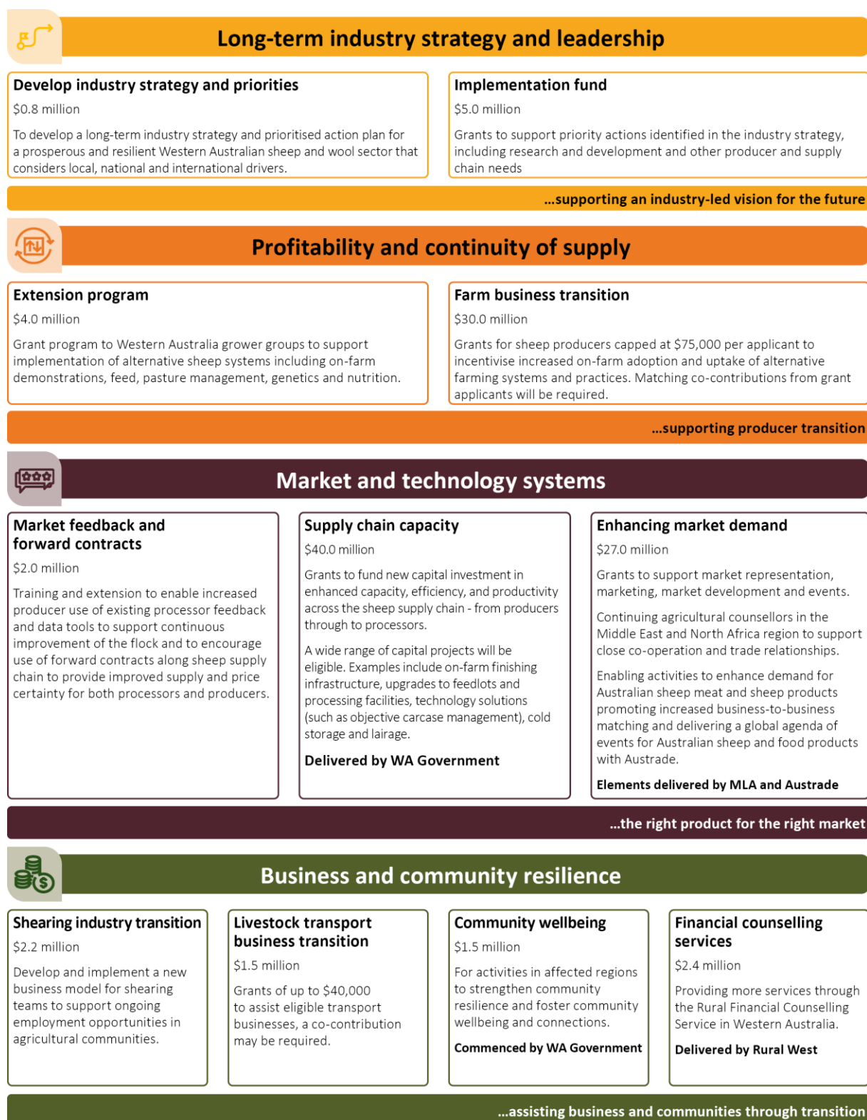
Figure 3 – Summary of key components following co-design

The following sections provide more detail on the program components under each theme, including the funding allocation, timing of activities and grant opportunities as well as how these program features relate to the co-design outcomes. The funding allocation is summarised in Figure 3.