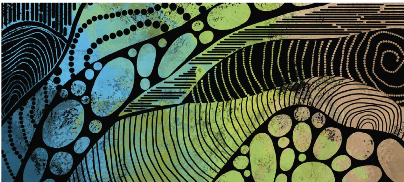
ARTWORK: Looking After Country © Elizabeth Yanyi Close 2021

The Australian Government acknowledges the Traditional Owners and Custodians of Country throughout Australia and recognises their continuing connection to land, waters and community. We pay respect to the people, the cultures and the elders past, present and emerging.