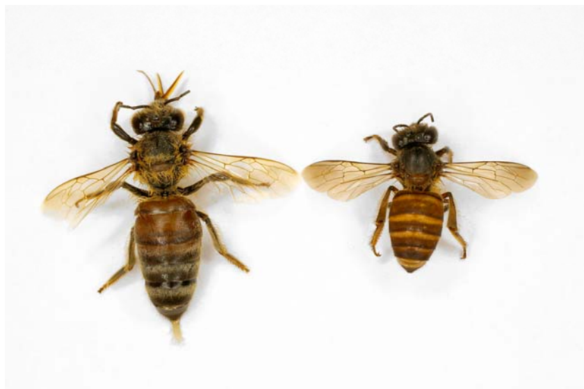
Figure 1: Apis mellifera and Apis cerana