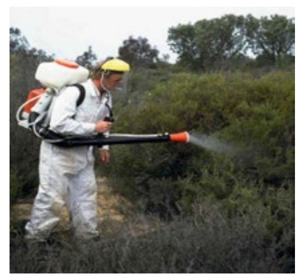
Figure 4 Foliar application of phosphite by backpack mister (Photo: B Shearer, Department of Parks and Wildlife, Western Australia).

In Western Australia, the Department of Environment and Conservation (WA DEC) conducted a large scale containment project on an infestation within an internally draining catchment in Fitzgerald River National Park. A Bayesian Belief Network model was developed for the range of management strategies and their effect on containment of the P. cinnamomi infestation. WA DEC constructed a 12 kilometre fence around the entire Bell Track infestation to prevent people and animals spreading the disease. In 2008, a threekilometre-long plastic membrane to prevent