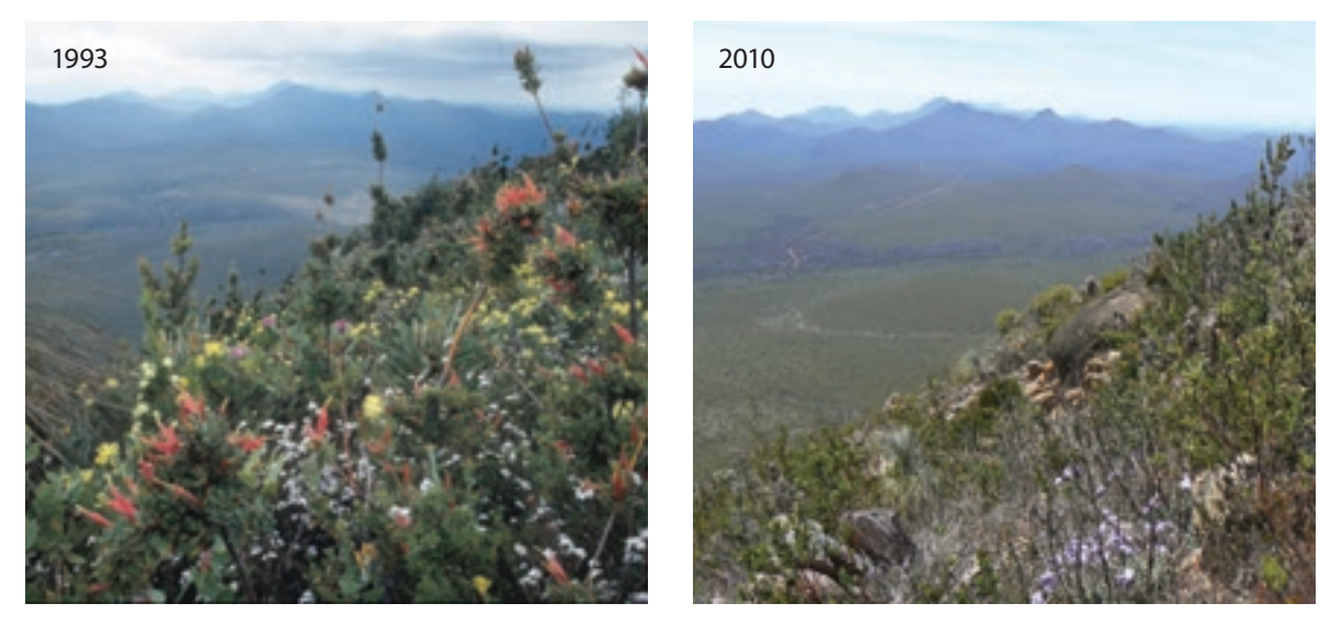
Damaged: These before-and-after images of Mondurup Peak, Stirling Range in Western Australia reveal the effects of P. cinnamomi on the landscape .

A list of over 1000 native plant species known to be susceptible to disease by P. cinnamomi in Australia is contained in the National Best Practice Guidelines (O'Gara et al., 2005b). The list has been compiled from published material, unpublished records and observations of individual researchers.