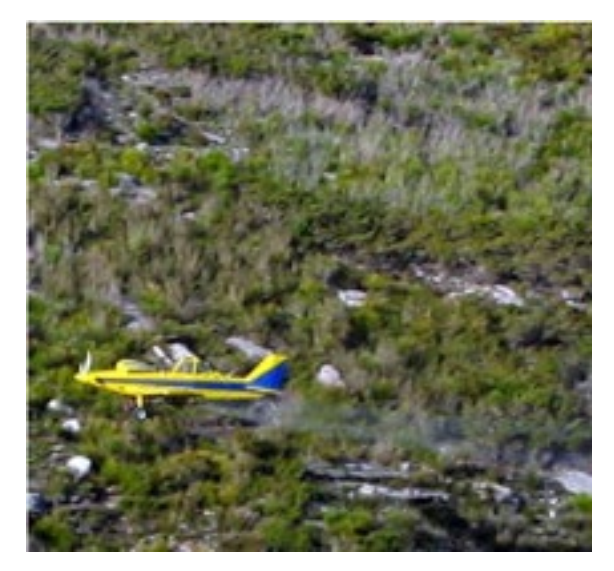
Figure 3 Aerial application of phosphite in Stirling Ranges National Park in the south-west of Western Australia (Photo: G Freebury, Department of Parks and Wildlife, Western Australia).

The cost of phosphite application precludes broad scale application to infected sites. The use of phosphite and/or ex situ conservation as a component of integrated management for a site or area requires a process of prioritisation and strategic planning. Highest priority may be given to sites assessed as ecologically or economically significant, or valued by the community.