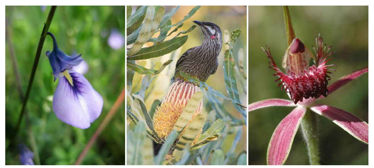
Photo: (from left) Native violet ( Hybanthus calycinus ) is common across the range of Banksia woodlands and unlike most violet relatives is a small sub-shrub (Copyright K Dixon). Wattle birds are aggressive defenders of the nectar sources in Banksia Woodlands and will actively defend nectar resources, sometimes to the detriment of other honey eater species (Copyright B Knott). Carousel spider orchid ( Caladenia arenicola ) is found through Banksia Woodlands and with its specialist sexually deceptive system of pollination requires high quality woodlands to ensure pollinator presence (Copyright K Dixon).