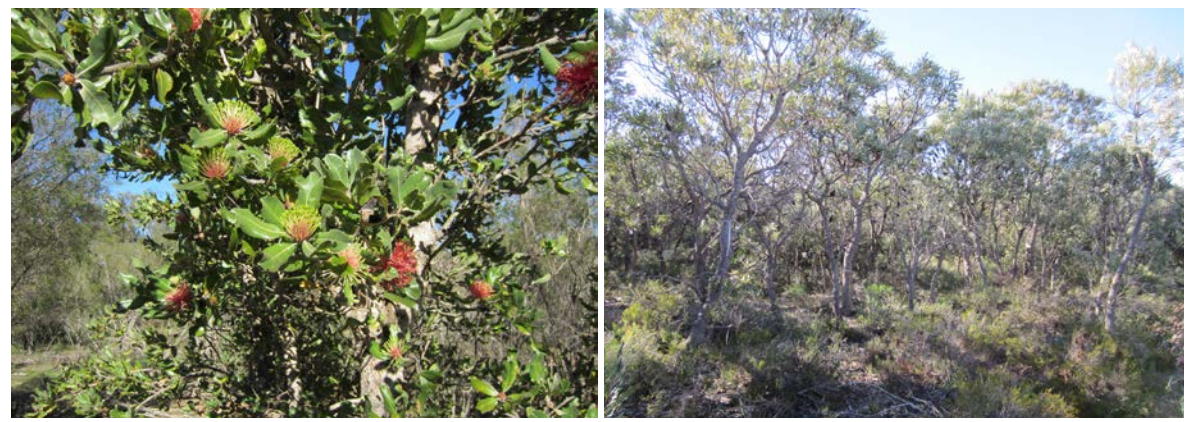
Photo: (from left) Banksia ilicifolia (matchstick Banksia) (Copyright Department of the Environment and Energy). Banksia Woodlands, Bullsbrook Nature Reserve is representative of woodland developed on Bassendean sands (Copyright Department of the Environment and Energy).