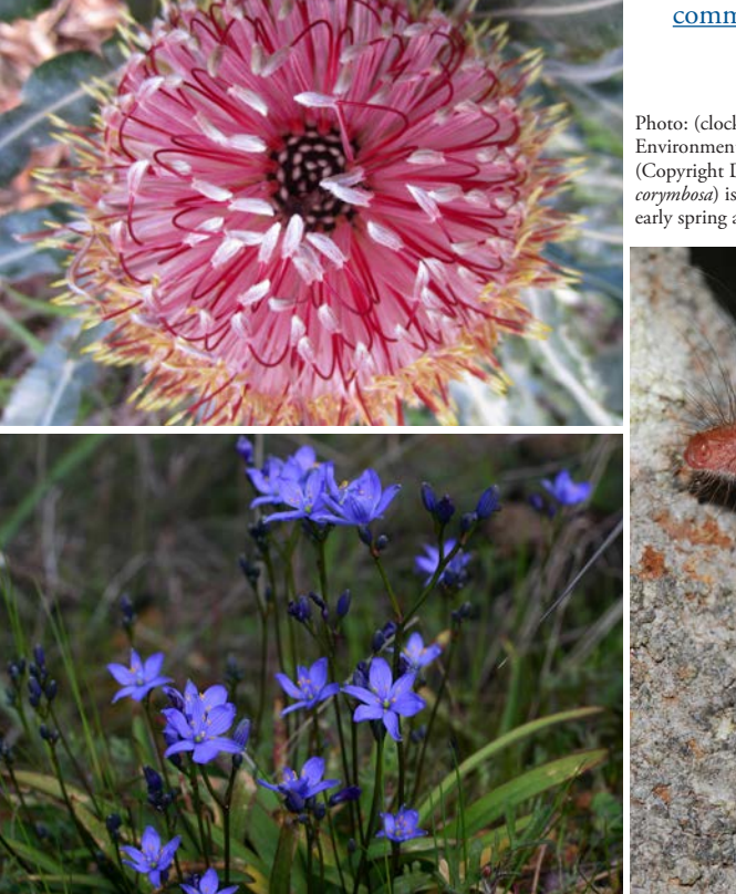
Photo: (clockwise) Banksia menziesii (Copyright Department of the Environment and Energy). Honey possum ( Tarsipes rostratus ) in woolly bush (Copyright Department of Parks and Wildlife, WA). Blue squill ( Chamaescilla corymbosa ) is a small and delicate geophytic lily that flowers in late winter to early spring and requires intact, non-weedy woodlands (Copyright K Dixon).

The Conservation Advice for the ecological community outlines a range of priority research and management actions that provide guidance on how to manage, restore and protect it. This Conservation Advice can be found on the Department's website: www.environment.gov.au/biodiversity/threatened/ communities/pubs/131-conservation-advice.pdf