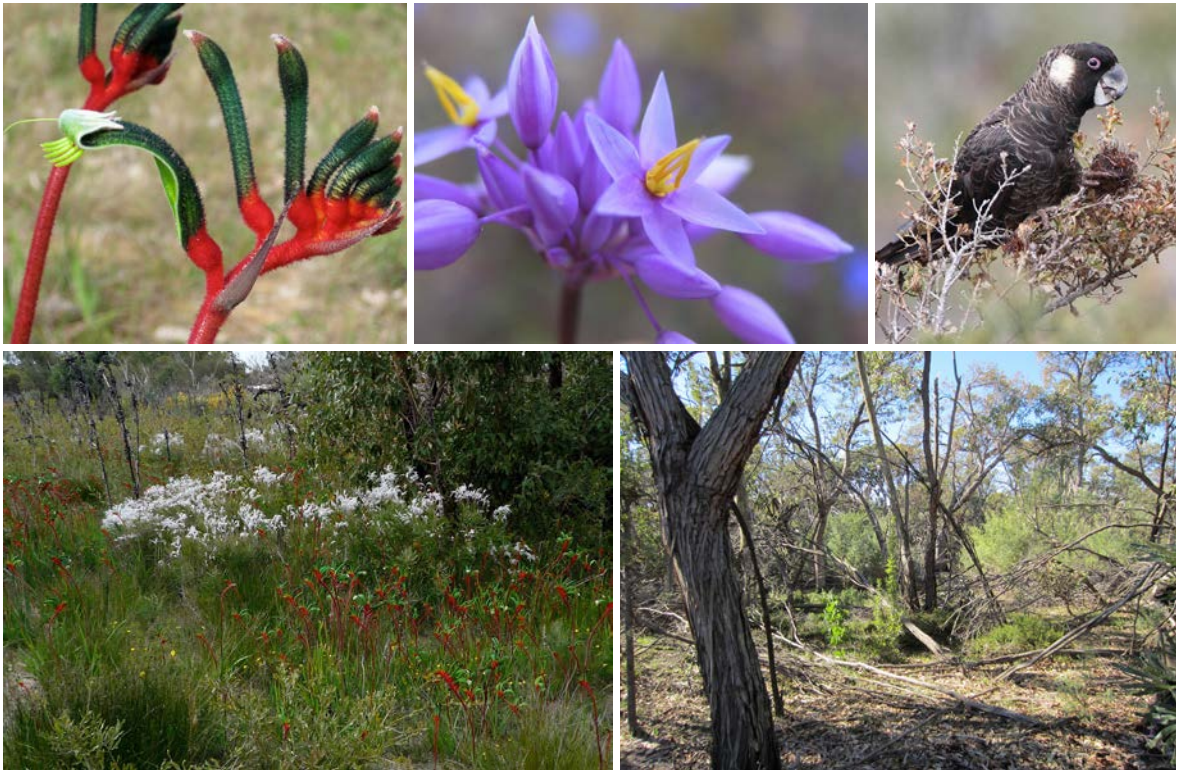
Photo: (top row, from left) The State floral emblem for WA, the red and green kangaroo paw ( Anigozanthos manglesii ) is also a common though declining species in Perth's Banksia Woodlands and an important nectar resource for honey eater species (Copyright K Dixon). Vanilla lily ( Sowerbaea laxiflora ) is a common low growing herb through woodlands (Copyright K Dixon). Carnaby's cockatoo feeds upon canopy stored seed in a number of Banksia species in the woodland community, seen here on B. sessilis (Copyright B Knott); (bottom row, from left) After a summer fire, Banksia Woodlands burst into bloom with resprouting flowering on smoke bush ( Conspermum stoechadis ), with smoke from the fire stimulating germination and flowering in red and green kangaroo paws ( Anigozanthos manglesii ) (Copyright K Dixon). Banksia Woodlands, Lowlands is an excellent example of privately owned and managed woodland that has a mixture of wet inter-woodland damplands and upland woodland in outstanding condition (Copyright Department of the Environment and Energy).