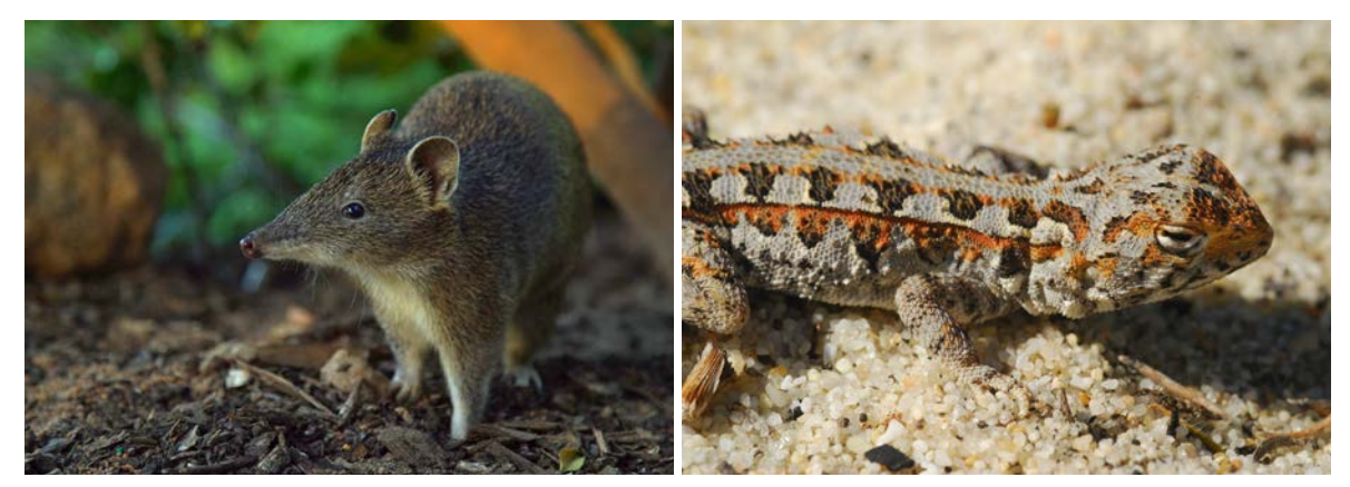
Photo: (from left) Quenda (Isoodon obesulus) (Copyright Simon Cherriman). Western heath dragon (Ctenophorus adelaidensis) (Copyright Department of Parks and Wildlife, WA).

Many animal species found in the ecological community also benefit from other native vegetation across the landscape. The greater effective area of habitat supports larger populations of many species, and greater total diversity. Landscape connections may also allow better recovery of populations to disturbances such as fire, if burnt patches can be easily re-colonised. Even small remnants of Banksia Woodlands within urban areas can retain high floral diversity and be important "stepping stones" or pollination/dispersal routes between larger native vegetation remnants.