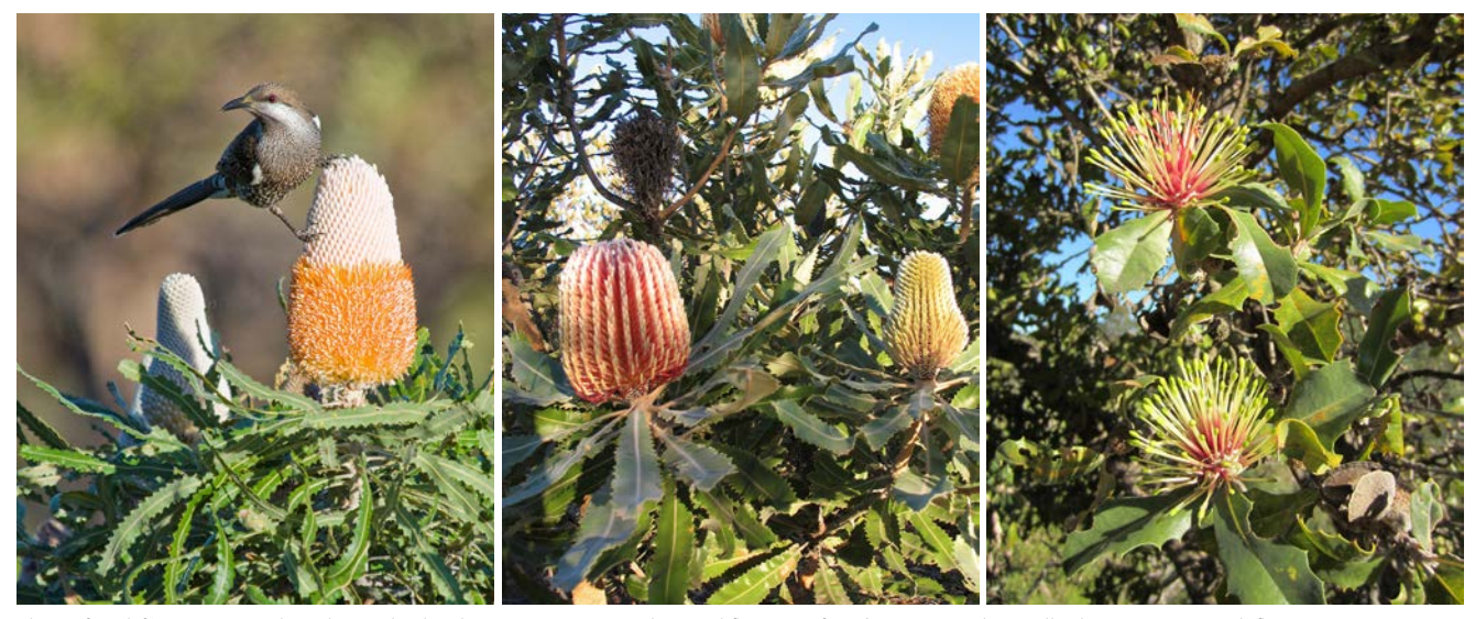
Photo: (from left) Honey-eaters depend upon the abundant nectar resources and seasonal flowering of Banksia species in the woodland communities—with flowering in Banksia prionotes (acorn Banksia) providing important food in the sparse autumn flowering period. A flagship species of Banksia Woodlands is Banksia menziesii or firewood Banksia, so-called as it was a favoured wood for burning by settlers. Banksia ilicifolia is a key 'nectar-bridging' species for many nectar feeding birds and honey possums in Banksia woodland. The species is however highly sensitive to depletion of the water table through water extraction..

Banksia littoralis (swamp banksia) and B. burdettii (Burdett's banksia) may be co-dominant in some areas, but where they become dominant, they typically form other communities and are not considered the Banksia Woodlands of the Swan Coastal Plain ecological community.