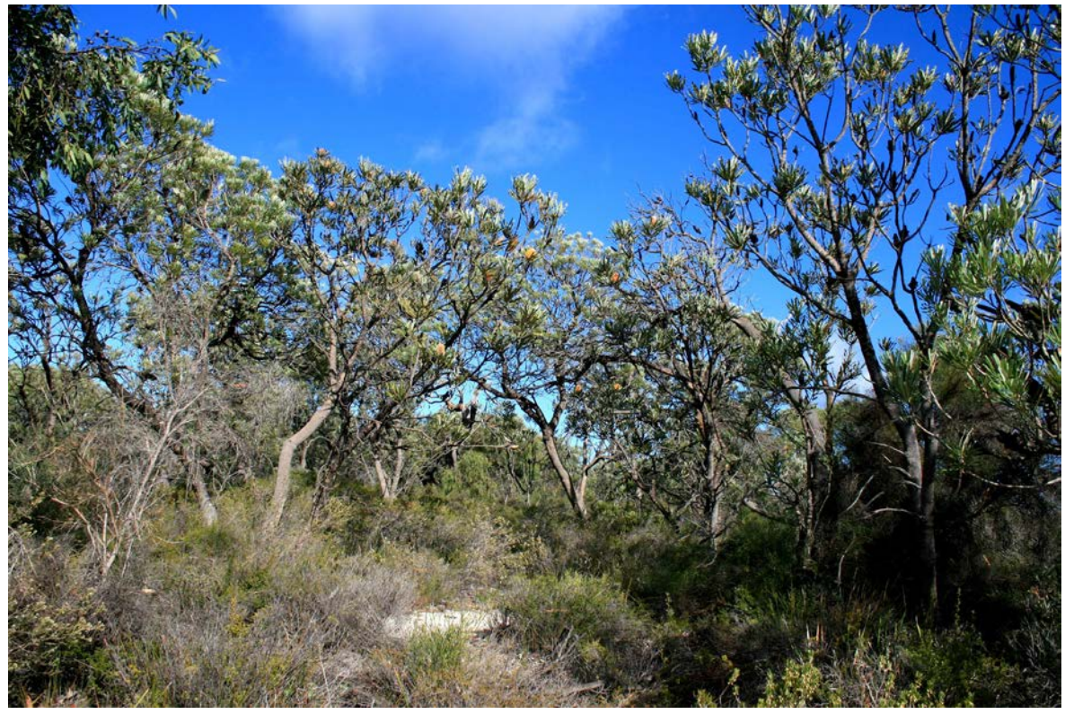
Photo: Healthy banksia woodland: Note the dominant layer of Banksia trees over a native understorey of diverse shrubs and herbs (Copyright: Rob Davis)