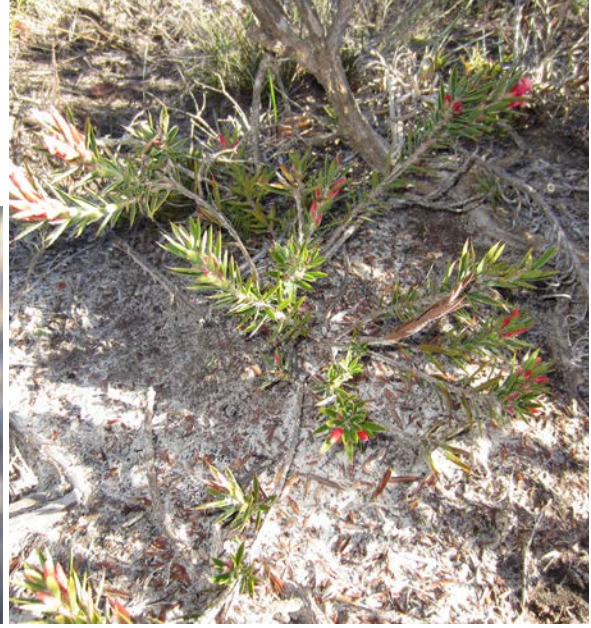
Photo: Astroloma stomarrhena (red swamp cranberry) one of a suite of Ericaceae (native blueberry family) species that are fundamental nectar and pollen providers for native invertebrates during later autumn and winter when flowering plants are scarce. The family is particularly sensitive to habitat changes including winter/spring burning.