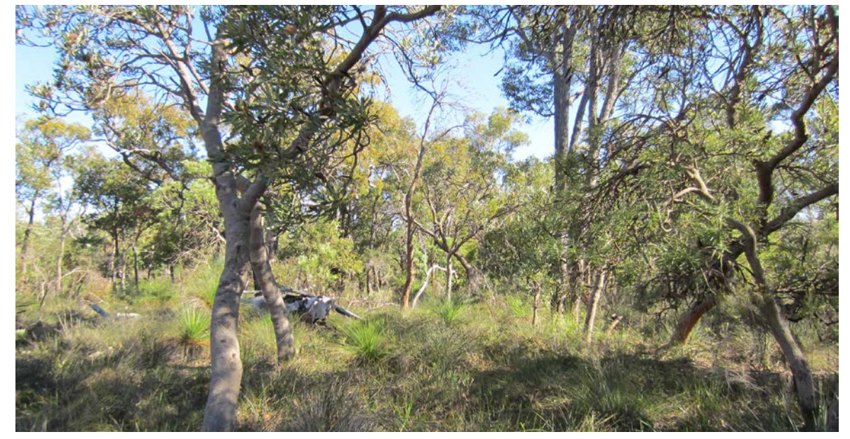
Photo: Banksia Woodlands, Cardup Nature Reserve.

Minimum condition thresholds help determine when a patch is considered too degraded to be protected as a 'matter of national environmental significance' under the EPBC Act, see Are all patches protected under the EPBC Act listing?