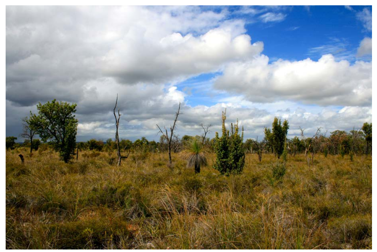
Photo: Degraded Banksia Woodland: Some Banksia Woodlands have been infected by dieback for over 50 years, and have lost the tree canopy layer with most understorey shrubs species lost. Only native sedges (Cyperaceae) and rushes (Restionaceae) survive dieback disease however these wind pollinated species provide few pollen and no nectar resources (Copyright: Rob Davis)