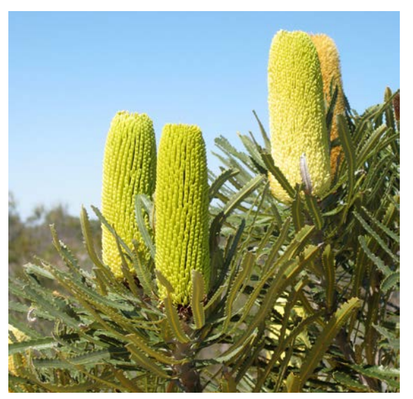
Photo: Banksia attenuata or candle Banksia is a dominant, summer flowering tree of woodland communities across their range (Copyright K Dixon)