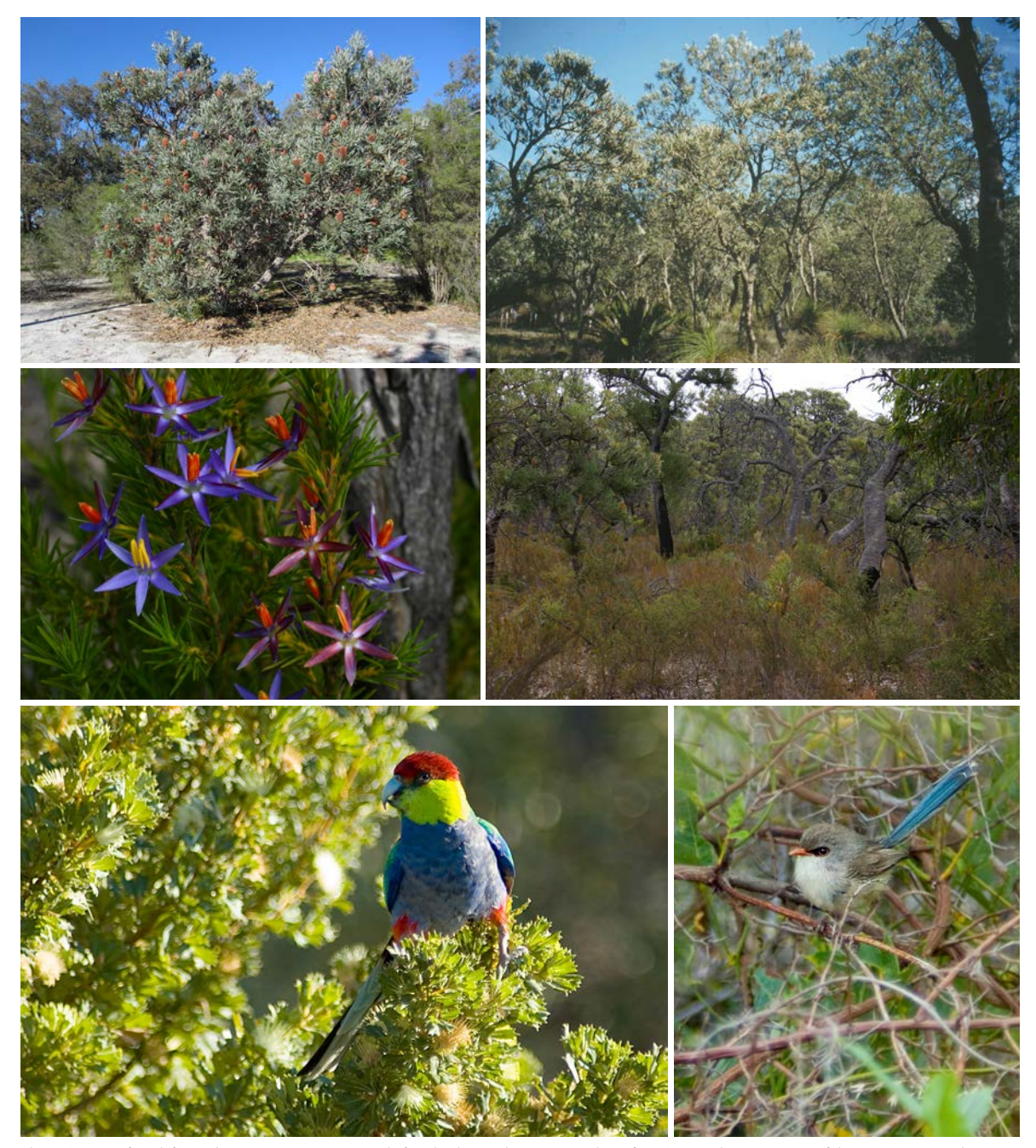
Photo: (top row, from left) Banksia menziesii as young trees before developing the more typical tree form (Copyright Department of the Environment and Energy). Long term unburnt Banksia Woodlands can maintain species richness and structure for long periods without fire—this woodland is 40 years without fire and exhibits healthy trees and a vibrant understorey (Copyright K Dixon). (middle row, from left) Blue tinsel lily or Star of Bethlehem ( Calectasia narnagara ), is winter flowering and widespread through woodland communities (Copyright K Dixon). Typical Banksia Woodlands north of Perth showing various age structures in trees, dead trees that provide important foraging habitat for animals and regrowth following a fire three years earlier (Copyright K Dixon). (bottom row, from left) Red capped parrot ( Purpureicephalus spurius ) feeding on Banksia sessilis (Copyright B Knott). Splendid wrens ( Malurus splendens ) occur in many parts of Banksia Woodlands (Copyright B Knott).