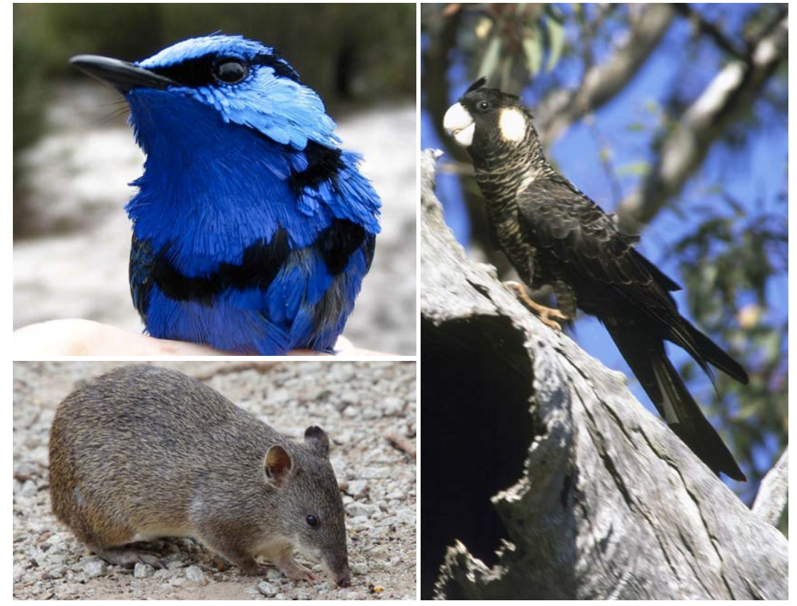
Photo: (clockwise) Splendid fairy wren ( Malurus splendens ). Carnaby's cockatoo ( Calyptorhynchus latirostris ). Quenda ( Isoodon obesulus ).

Opportunities exist for improving connectivity between patches (e.g. through replanting and restoration activities), to improve habitat availability for other species and ecological functioning of the Banksia Woodlands and other native vegetation.