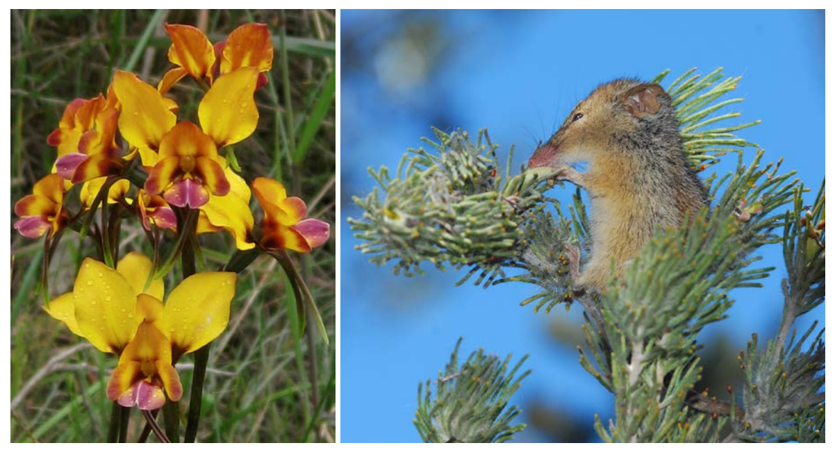
Photo: (from left) Orchids are surprisingly abundant and diverse through Banksia Woodlands, with the pansy orchid, Diuris magnifica having the largest and most colourful flowers of all of Australia's donkey orchids. Honey possum ( Tarsipes rostratus ) in woolly bush.