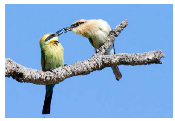
Photo: Seasonal visitors to Banksia Woodlands include the rainbow bee-eater that depends upon predator free areas and bare sand for supporting its ground nesting behaviour (Copyright B Knott)

The condition thresholds mean that small and degraded patches—such as remnants where the understorey has been largely replaced by weeds—are excluded from a listed ecological community and any actions do not need to be considered under the EPBC Act.