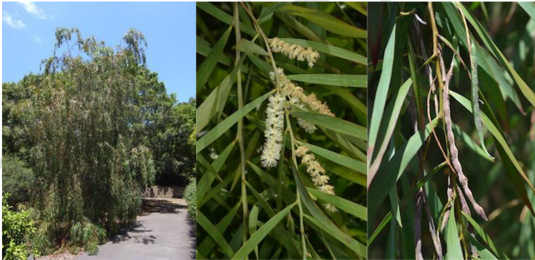
Photographs of Acacia courtii taken November 2012 at Mt Annan Botanic Gardens, NSW

This document combines the approved conservation advice and listing assessment for the species. It provides a foundation for conservation action and further planning.