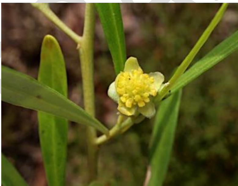
Bertya mollissima

This document combines the approved conservation advice and listing assessment for Bertya mollissima . It provides a foundation for conservation actions and further planning.