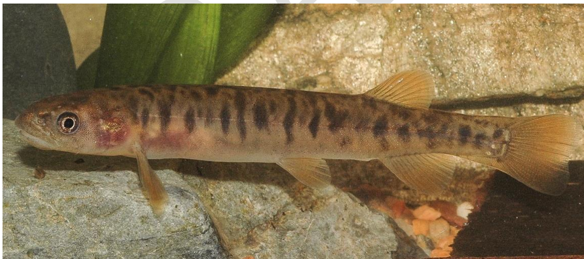
Galaxias aequipinnis (East Gippsland galaxias)

This document combines the approved conservation advice and listing assessment for the species. It provides a foundation for conservation action and further planning.