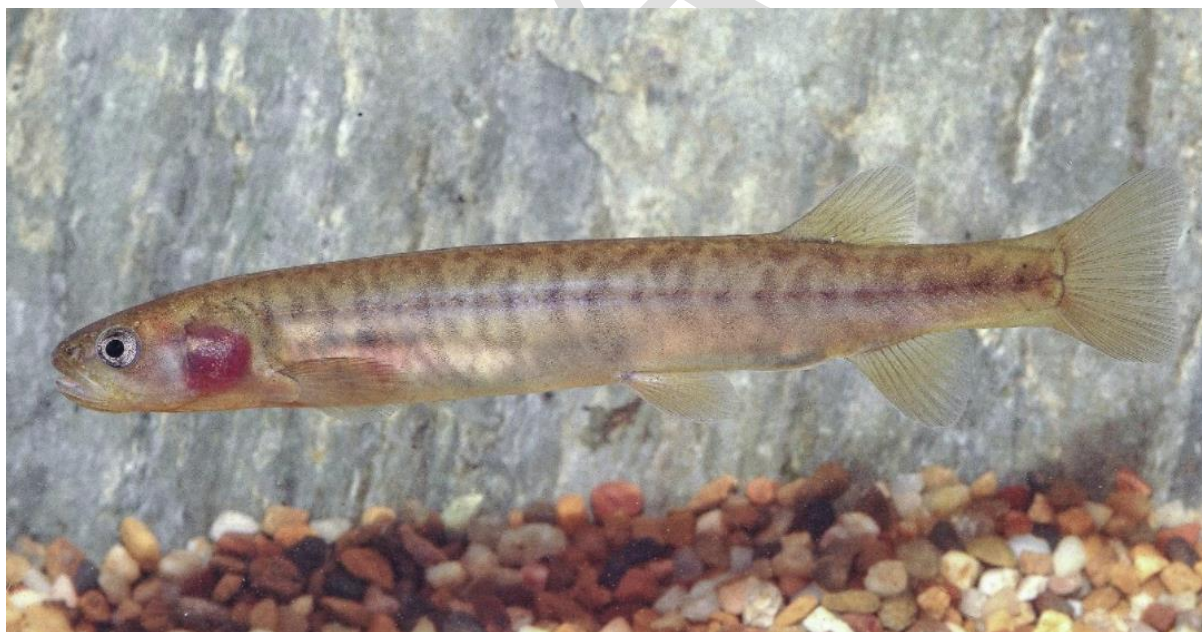
Galaxias gunaikurnai (Shaw Galaxias)

This document combines the approved conservation advice and listing assessment for the species. It provides a foundation for conservation action and further planning.