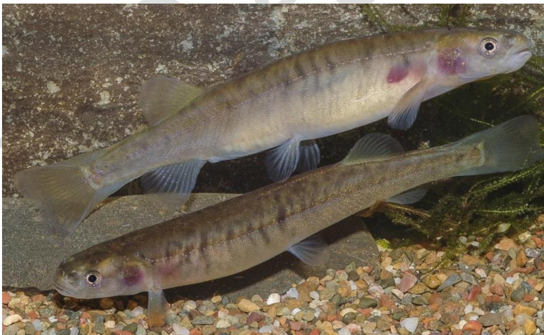
Galaxias lanceolatus (tapered galaxias)

This document combines the approved conservation advice and listing assessment for the species. It provides a foundation for conservation action and further planning.