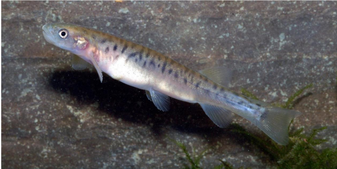
Galaxias longifundus (West Gippsland galaxias)

This document combines the approved conservation advice and listing assessment for the species. It provides a foundation for conservation action and further planning.