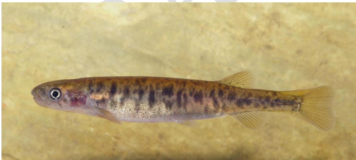
Galaxias mcdowalli (McDowall's galaxias)

This document combines the approved conservation advice and listing assessment for the species. It provides a foundation for conservation action and further planning.