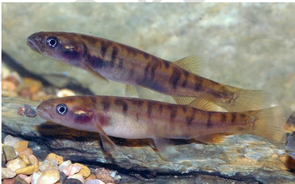
Galaxias sp. nov. 'Yalmy' (Yalmy galaxias)

This document combines the approved conservation advice and listing assessment for the species. It provides a foundation for conservation action and further planning.