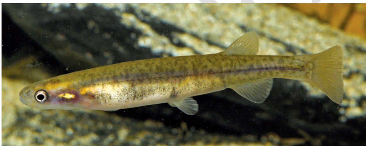
Galaxias terenusus ® Copyright, Rudie Kuitert (From Victoria's Galaxiid Fishes)

Note: Specific consultation questions relating to the below draft assessment and preliminary determination have been included in the consultation cover paper for your consideration.