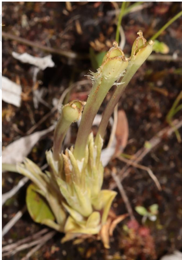
Gentiana wissmannii (New England gentian)

This document combines the approved conservation advice and listing assessment for the species. It provides a foundation for conservation actions and further planning.