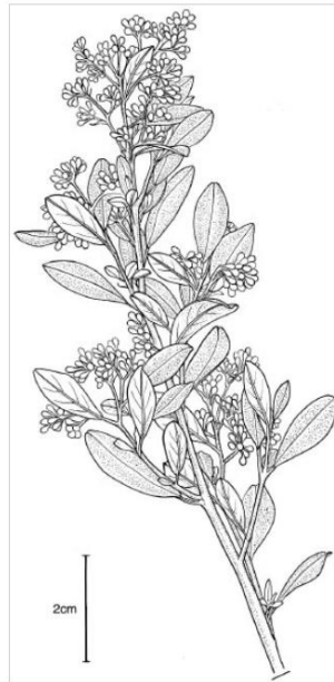
Sketch of grey deua pomaderris ( Pomaderris gilmourii var. cana ) © Copyright J Miles (from Royal Botanic Gardens and Domain Trust)