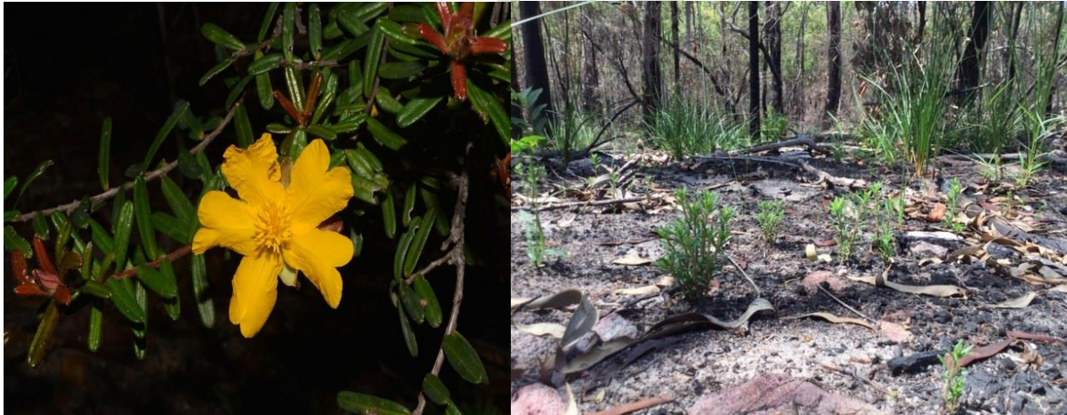
Hibbertia marginata, Richmond Range, NSW (left). Hibbertia marginata seedlings after a low to medium intensity fire in Gibberagee State Forest 2021 (right).

This document combines the approved conservation advice and listing assessment for the species. It provides a foundation for conservation action and further planning.