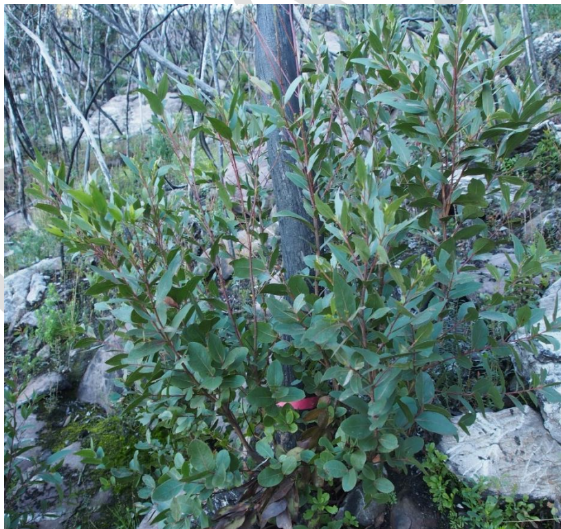
Eucalyptus imlayensis

This document combines the approved conservation advice and listing assessment for the species. It provides a foundation for conservation actions and further planning.