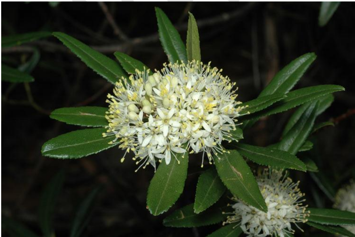
Leionema coxii

The survey effort is not considered adequate and there is insufficient scientific evidence to support the assessment.