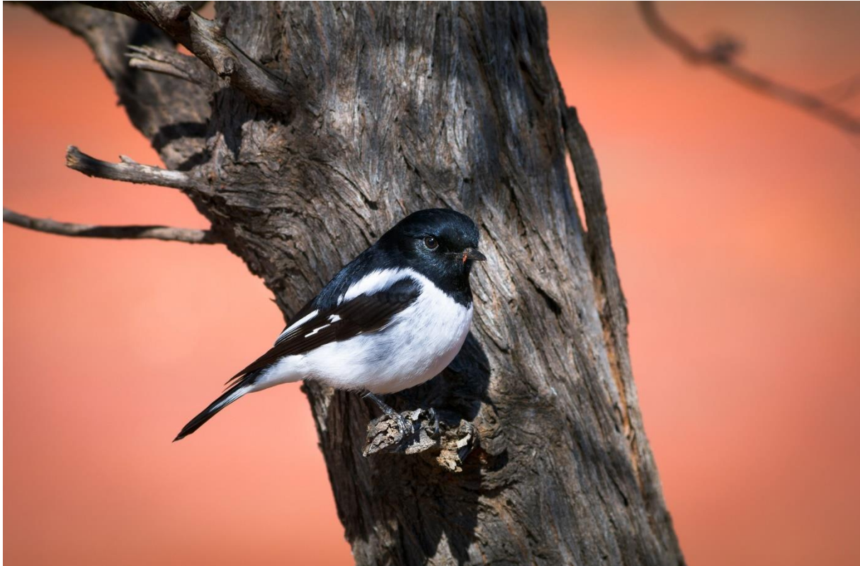
Hooded Robin (south-eastern)