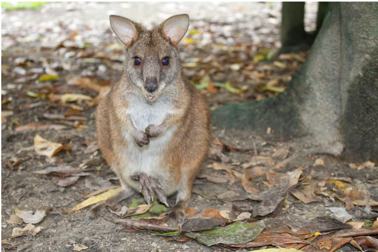
Photo of Notamacropus parma (parma wallaby)

Note: Specific consultation questions relating to the below draft assessment and preliminary determination have been included in the consultation cover paper for your consideration.