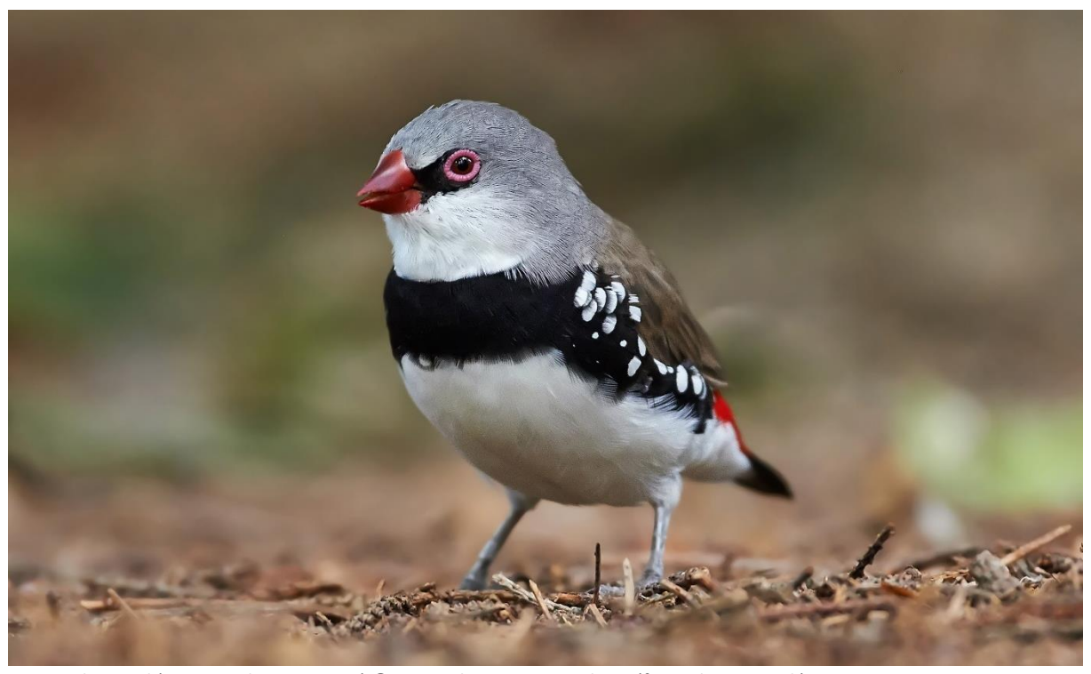
Diamond Firetail (Stagonopleura guttata)