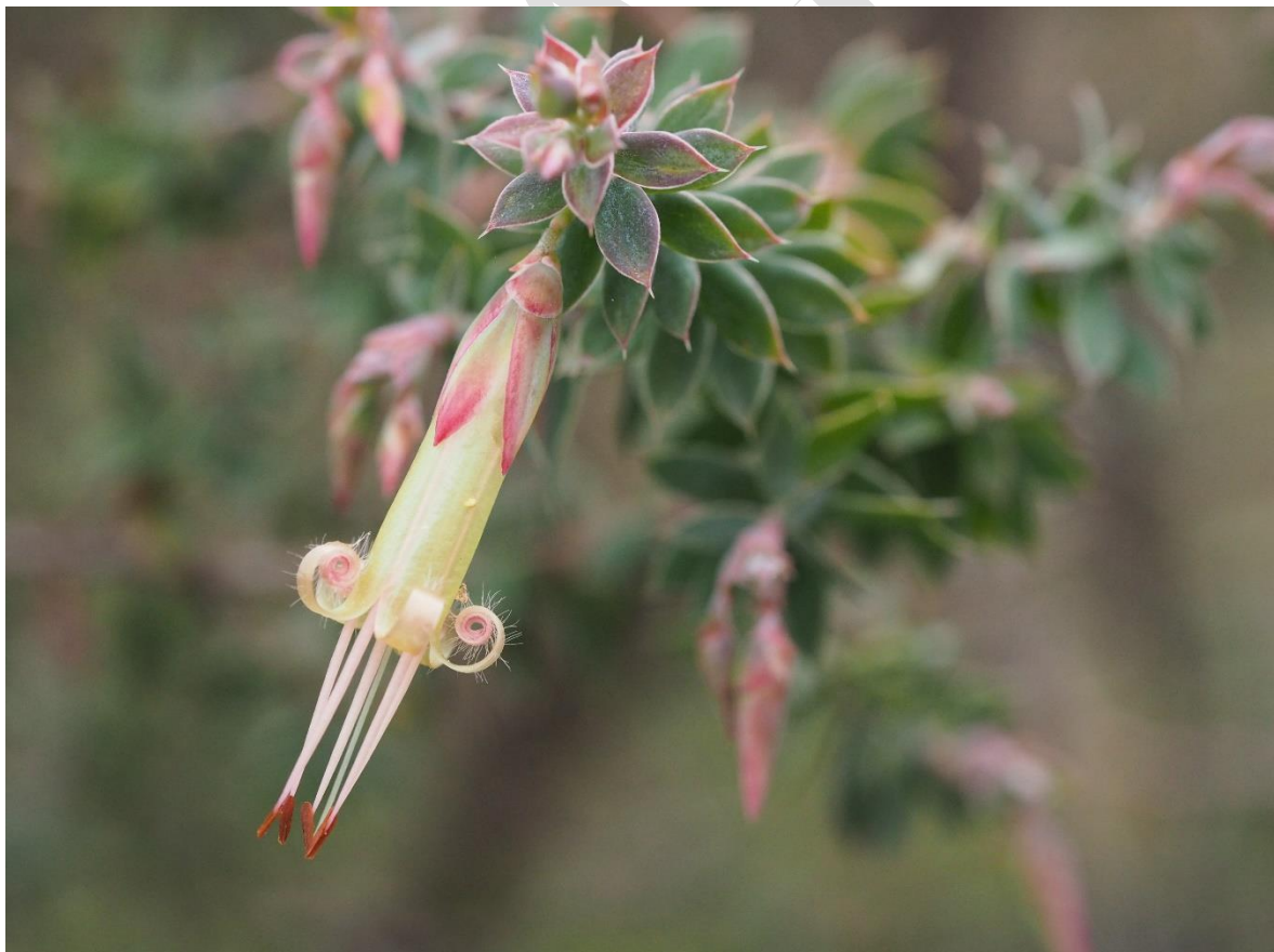
Photo of Styphelia perileuca (montane green five-corners)

This document combines the draft conservation advice and listing assessment for the species. It provides a foundation for conservation actions and further planning.