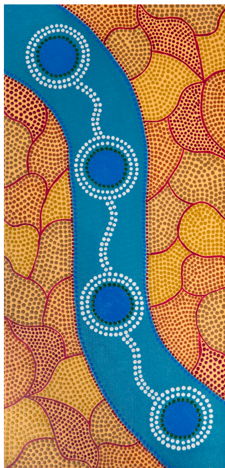
Connections

This year we are reviewing our Reconciliation Action Plan. Our next plan will draw on the progress we have made and the lessons we have learned under our current plan. We will focus on becoming an employer of choice for Aboriginal and Torres Strait Islander people and create an environment in which Indigenous employees can thrive, as well as how we can better consider Indigenous outcomes at the design stage of policies and programs. We intend to launch the new plan in late 2019.