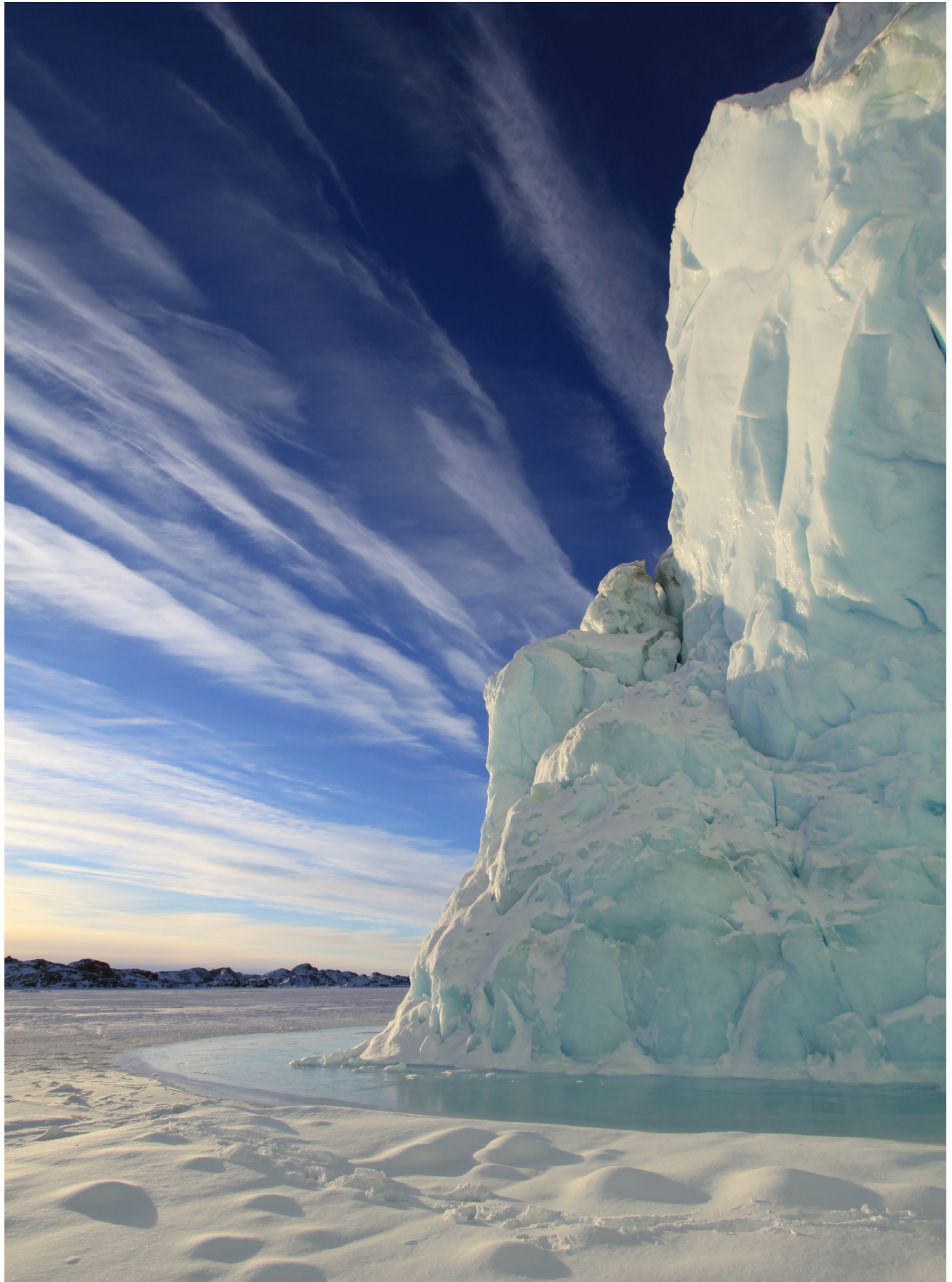
Blue iceberg at Kazak Island near Casey research station