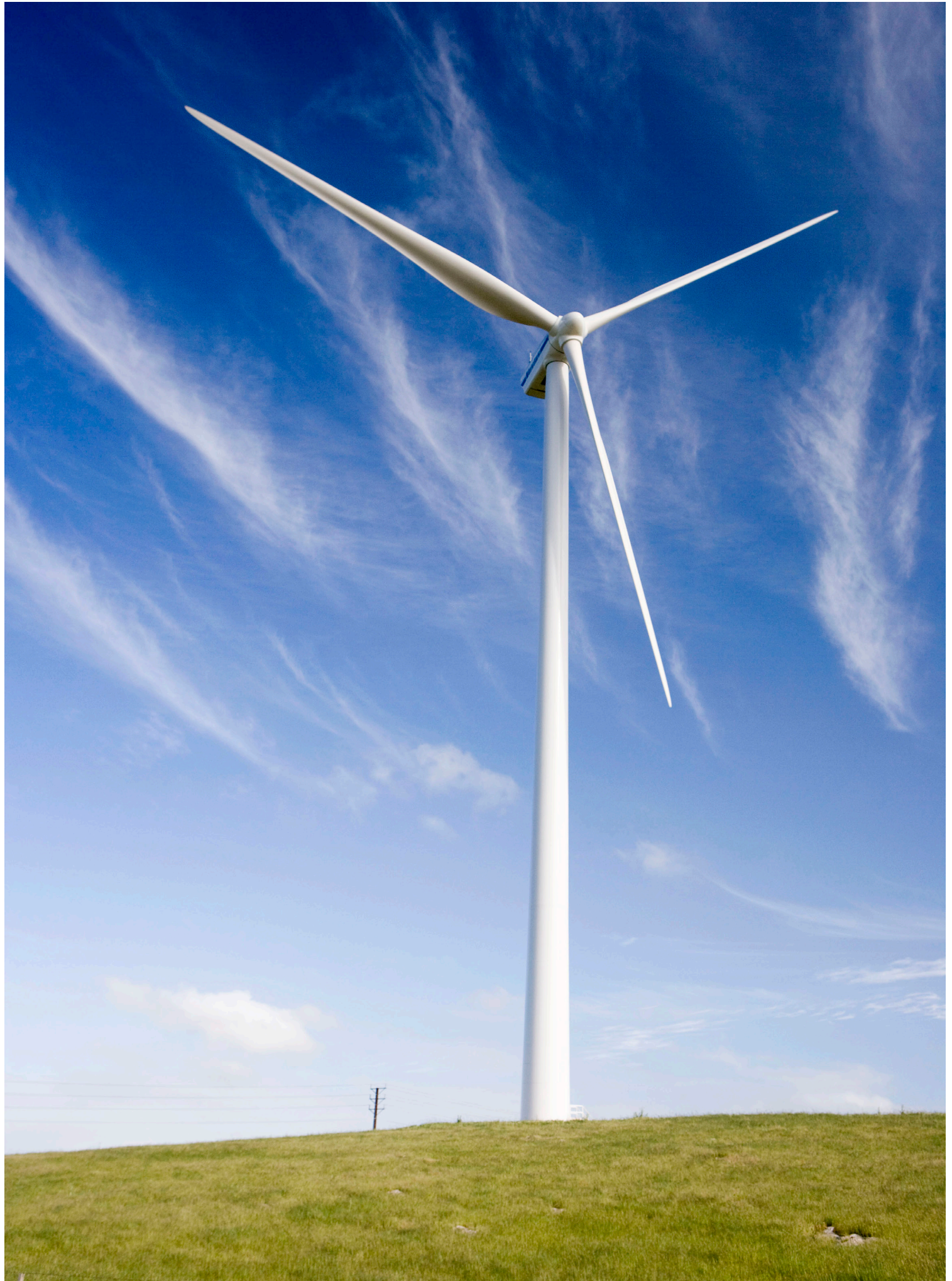
Woakwine Range Wind Farm, South Australia