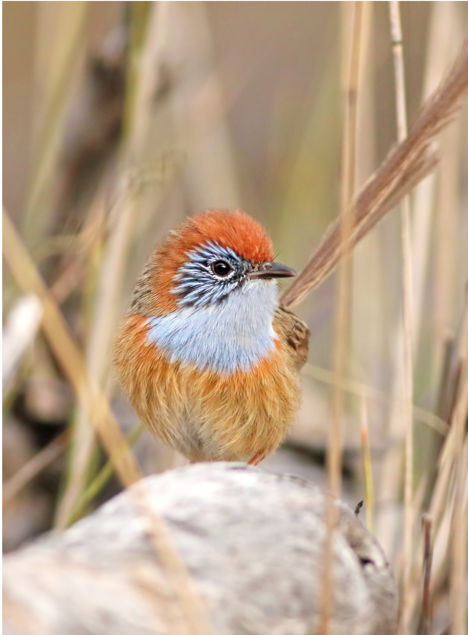
Mallee emu-wren