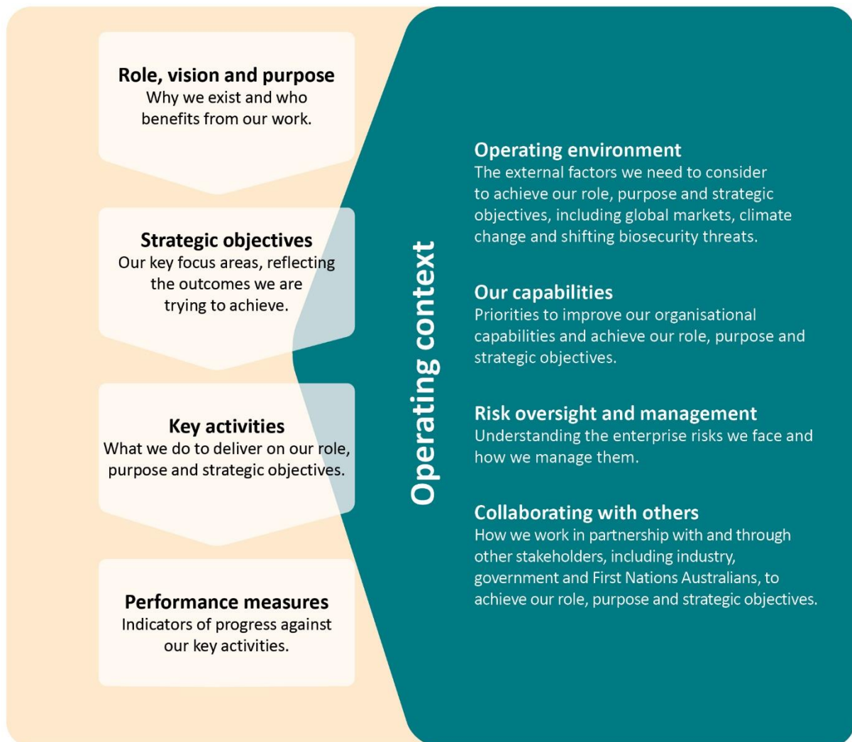
Figure 1 Elements of our corporate plan

Our corporate plan explains who we are, what we do and how we measure progress towards achieving our purpose and strategic objectives. Figure 1 shows the key elements of our corporate plan and how they connect.