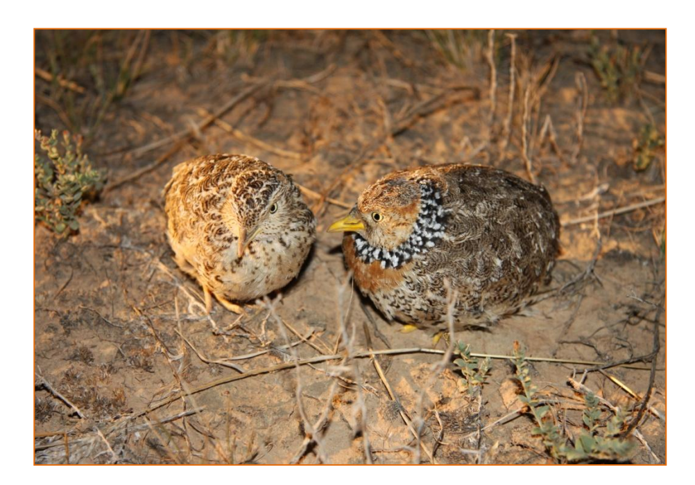
Figure 1: Plains-wanderer male (left) and female (right) in sparse grassland habitat.