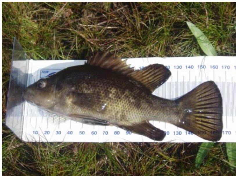
Figure 2: Typical adult Macquarie perch from the Hawkesbury-Nepean system.