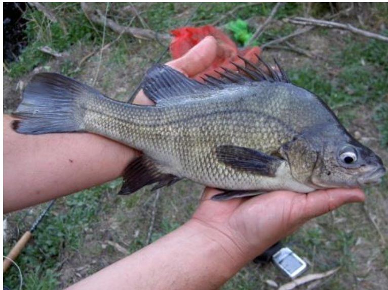
Figure 1: Typical adult Macquarie perch from the Murray-Darling Basin.

The Macquarie perch recently had its complete mitochondrial genome sequenced so that further studies can be undertaken into the species' evolution, population genetics, conservation and taxonomy (Gan et al., 2014). The species was the first of its genus Macquaria to be sequenced (Gan et al., 2014).