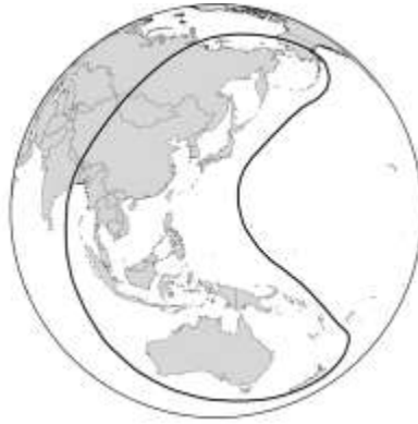
Figure 1. East Asian – Australasian Flyway

Thirty-seven species of migratory shorebird regularly and predictably visit Australia during their non-breeding season, from the Austral spring to autumn. Australia's coastal and freshwater wetlands are important habitat for these migratory shorebirds during the non-breeding season as places to rest and feed, building energy reserves to travel the long distance (up to 13 000 kilometres) back to their breeding grounds. In the month or two before migrating, migratory shorebirds need to increase their bodyweight by up to 70 per cent to sustain their journey.