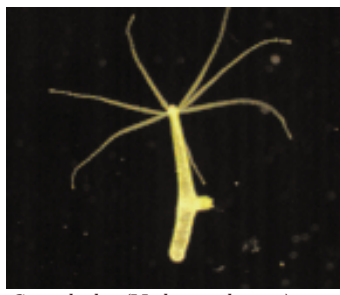
Green hydra (Hydra viridissima)