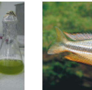
Green alga (Chlorella sp.)