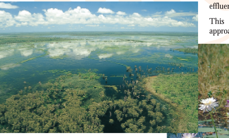
Magela floodplain in Kakadu National Park is classified as part of a World Heritage Area, and is a highly valued and protected ecosystem

The eriss ecotoxicology program was established in the late 1980s to assess the toxicity of, and determine