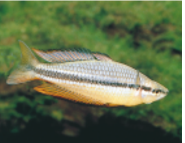
Adult black-banded rainbowfish (Melanotaenia nigrans)