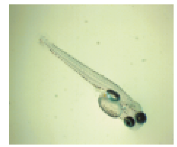
Purple-spotted gudgeon – Sac-fry (< 24-h old)

* not used routinely at eriss ** presence in floodplains is unconfirmed, but likely