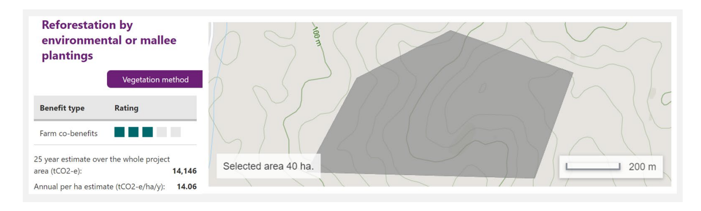
Figure 2: Example of LOOC-C outputs and FAE for a 40-ha planting area

Figure 2 is an example of the information generation by these inputs.