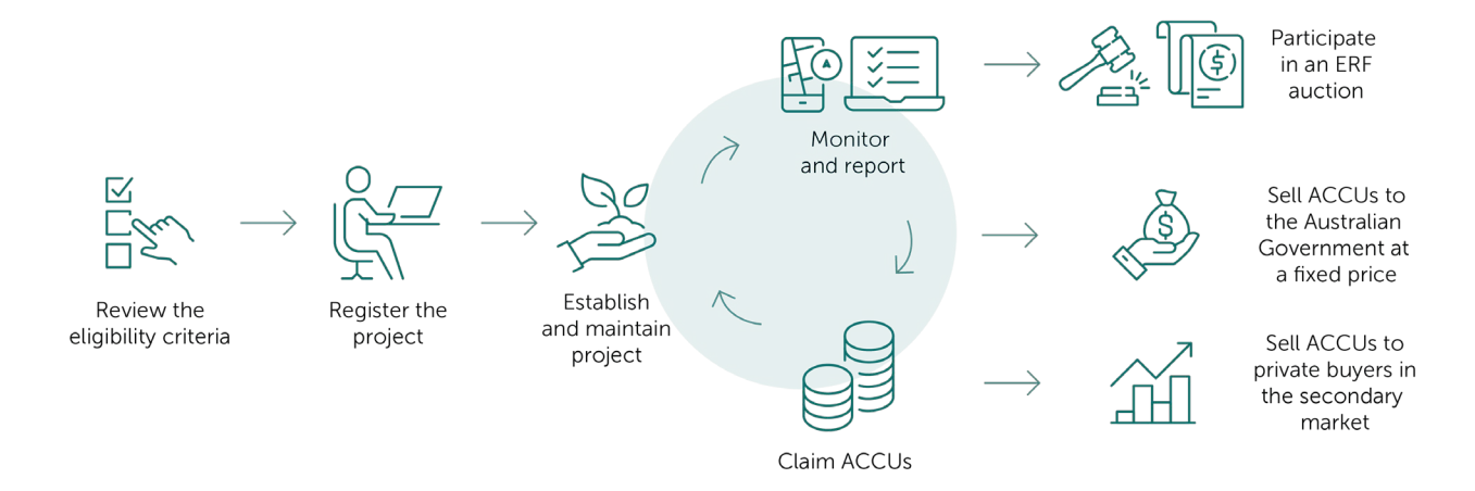
Figure 1: Lifecyle of an environmental plantings pilot project