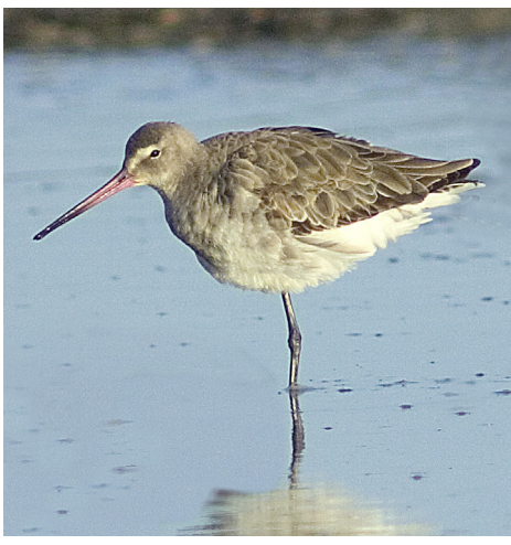
Photo: Black-tailed godwit, Moreton Bay Ramsar site © Graeme Chapman

In 2007 a female bar-tailed godwit fitted with a small satellite device took off from Alaska on 30 August and was tracked to New Zealand where she landed on 7 September, having flown 11,680 km in eight days. The bird, known as 'E7', from her coded leg flag, probably only weighed about 600 g.