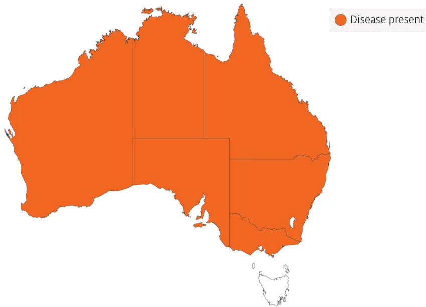
Map 1 Presence of Aphanomyces invadans , by jurisdiction

EUS is endemic in many freshwater catchments and estuaries in Australia. The disease has been officially reported from New South Wales, the Northern Territory, Queensland, Victoria, South Australia and Western Australia.