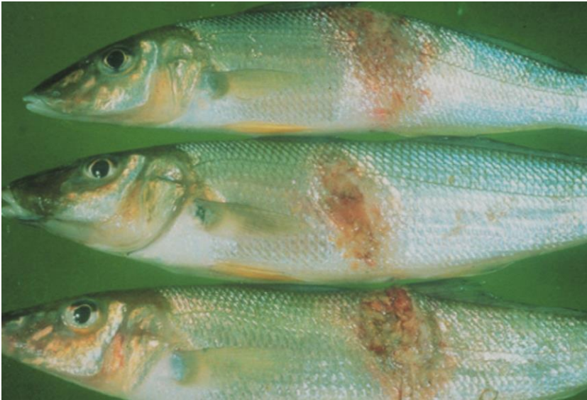
Figure 3 EUS in sand whiting ( Sillago ciliata )

Note: Progression of red lesion (top) to deep ulcer (bottom) of classical red sores on the body.