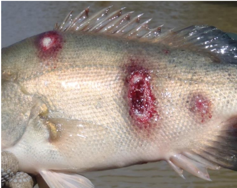
Figure 1 EUS in golden perch ( Macquaria ambigua )

Note: Multiple ulcerative lesions on flanks caused by infection with Aphanomyces invadans .