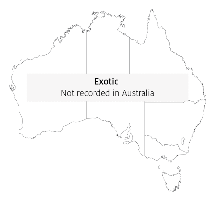
Map 1 Presence of ISKNV-like viruses, by jurisdiction

ISKNV-like viruses have not been recorded from wild fish in Australia. However, these viruses are regularly detected in ornamental fish in quarantine at the international border, and in retail pet shops.