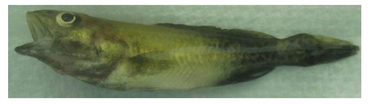
Figure 2 Murray cod ( Maccullochella peelii ) fingerling experimentally infected with an ISKNV-like iridovirus

Note: Discolouration around the front of the body (normal colouration evident near the tail) and signs of respiratory distress at time of death (flared opercula).