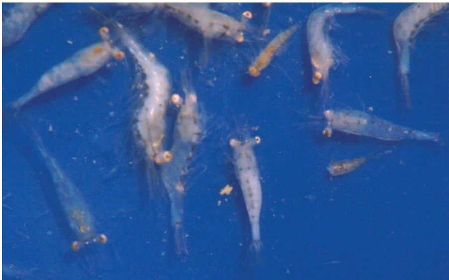
Figure 1 White tail disease in giant freshwater prawn ( Macrobrachium rosenbergii ) postlarvae infected with MrNV

Note: Compare opaque musculature of affected prawns with the more transparent healthy prawns.