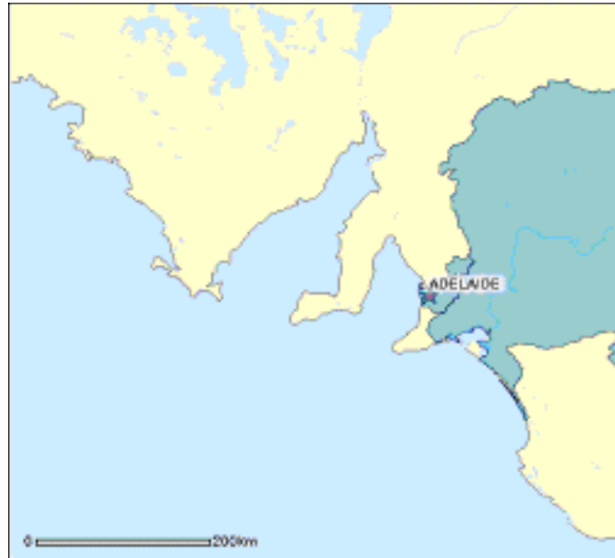
Figure 2: South Australian water catchments