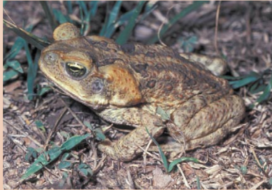
Cane toads were introduced into Australia in an effort to control insect pests of sugar cane. The control attempt failed and now cane toads are regarded as pests themselves.

State and territory governments have specific legislation relating to conservation of biodiversity and have responsibility for managing invasive species at local, regional and state levels. State and territory