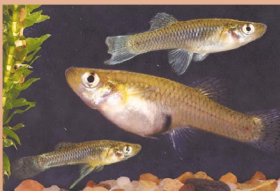
The plague minnow Gambusia holbrooki is one of over 20 species of exotic fish introduced into Australian waters. It competes for food with native fish and may contribute to the reduction of some types of aquatic vegetation.

In Australia, invasive species cause immense damage to our soils, native plants and animals, and annual production losses worth millions of dollars. Feral animals such as rabbits, goats, cattle, buffalos, pigs, donkeys, horses and camels degrade natural habitats by intensive or selective grazing. Animals with hard hoofs compact the soil, making it difficult for native vegetation to grow and contributing to erosion. They also compete with native animals for food and habitat. Feral rabbits can take over the burrows of native animals such as bilbies and bandicoots. Feral cats and foxes hunt and kill many native animals and are a major factor in the disappearance of the numbat and mallee fowl from many areas.