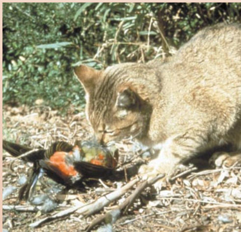
Although it is known that feral cats prey on native mammals, birds and reptiles, the details of their impact on native wildlife are still being researched.

Australia is home to many plants and animals that have been introduced since European settlement. Some of these have become invasive — they have spread and multiplied to the point where they damage the environment, threaten the continued existence of native plants and animals, or create significant problems for agriculture. Invasive animals, often called feral animals, and invasive plants or 'weeds' are one of the biggest environmental problems facing Australia today. The Australian Government, working with the states and territories, is supporting research and developing management plans to reduce the impact of invasive species on Australia's native plants and animals and on agriculture.