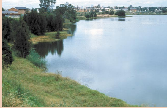
An aquatic beetle Agasicles hygrophila has been used to remove an alligator weed infestation from the Georges River in Sydney. Booms floating on water have been used to control the weed in other locations.

The impacts of invasive fish can include predation on native animals, competing with native fish for food or habitat, uprooting aquatic vegetation, disturbing sediments and introducing diseases or parasites.