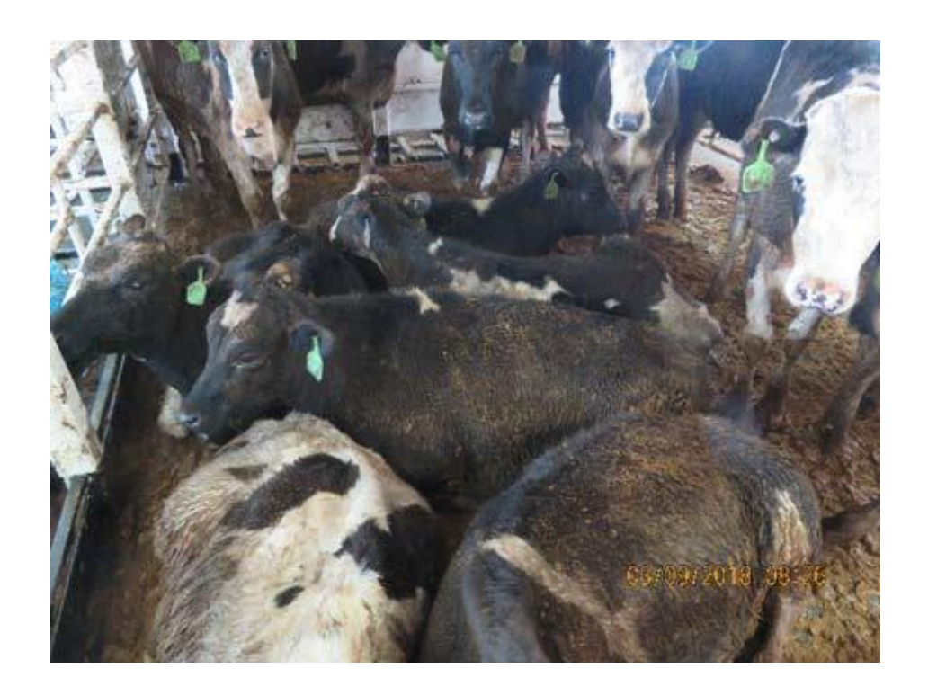
IO Report 40 - MV Ocean Ute, Portland to China, November 2018