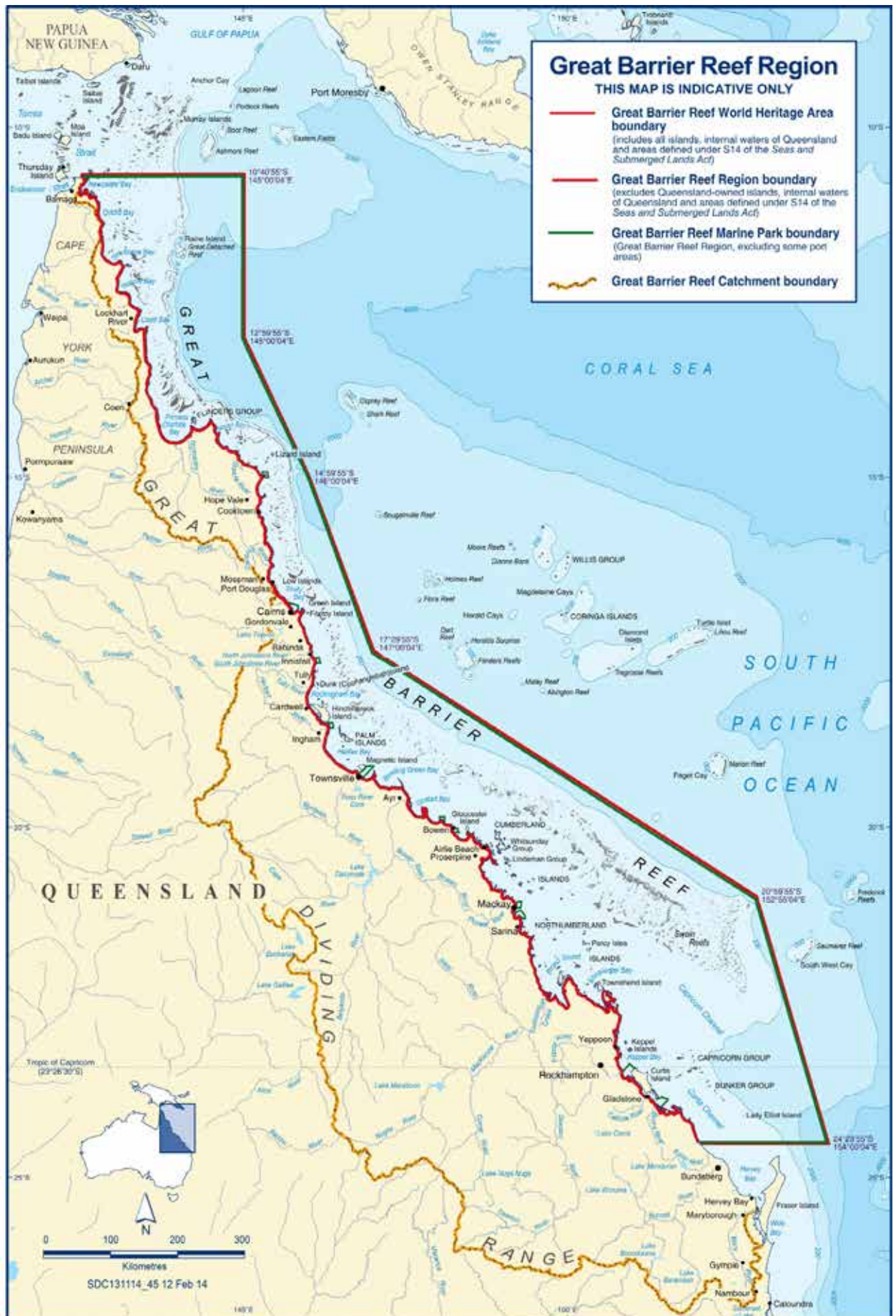
The Great Barrier Reef and its catchment