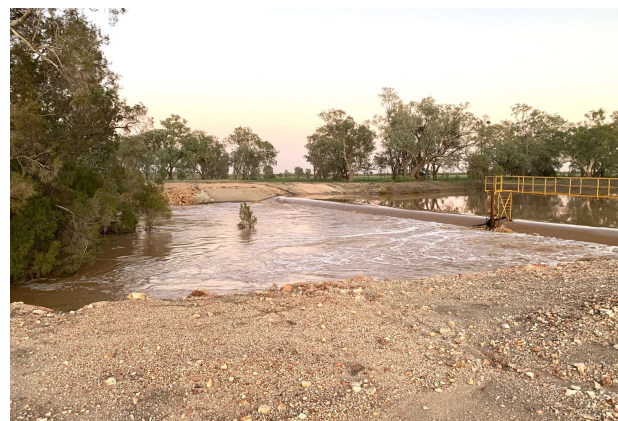
A business case will be developed for a fishway at the Cubbie Weir along the Culgoa River as part of the Northern Basin Toolkit

The Australian Government is funding several projects to enhance the benefits of water for the environment across the Lower Balonne. These projects form part of the Northern Basin Toolkit .