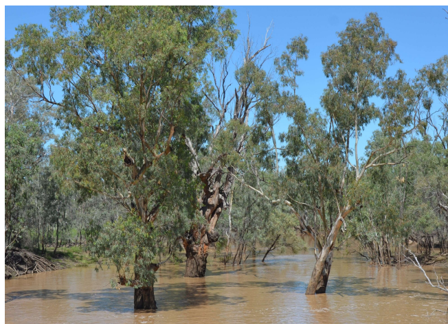
Narran River downstream of the Clyde Weir flowing at around 1,076 ML/d on 30 March 2021

More than 330 gigalitres (GL) has flowed passed the St George gauge since January 2021. This inflow is important, but relatively small: only one-third of the historical annual average and less than a quarter of the 1,442 GL that passed St George in early 2020. Commonwealth water for the environment contributed around 43 GL across the Queensland Lower Balonne rivers during March and April 2021. Over 36 GL of this water passed the New South Wales border, contributing to flows downstream in the Darling River. The Commonwealth portfolio also contributed around 3 GL from the Nebine Creek. This water will help build on the environmental benefits achieved from last year's flow event .