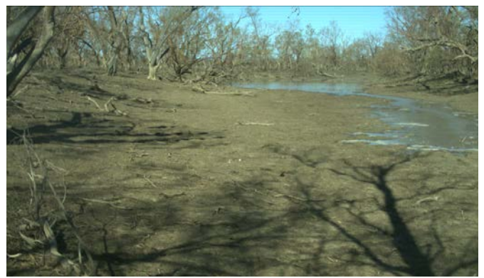
Flow entering the top of the parched Narran Lakes Nature Reserve on Saturday 29 February.

29 February and as of 5 March, more than six gigalitres had started to fill the lakes.