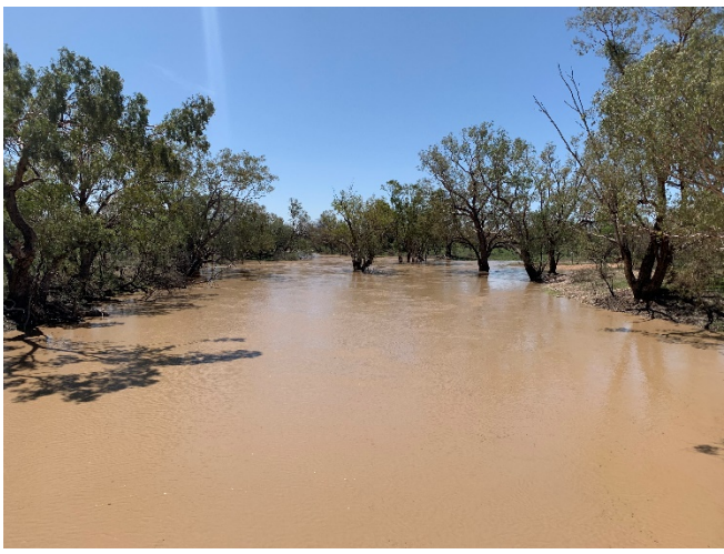
Narran River flowing at ~2,500ML/d upstream from Bangate Bridge – 28 February 2020.