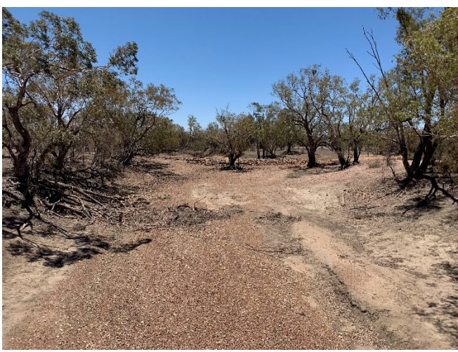
A dry Narran River channel - upstream from Bangate Bridge - 7 December 2019.

Cubbie Station has also provided a voluntary contribution of 10 gigalitres to this flow - most of which went down the Culgoa River.