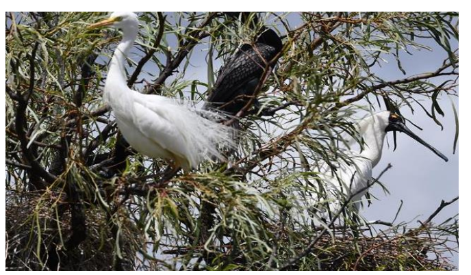
Intermediate egret, Cormorant, and Royal spoonbill at Dharriwaa, 26 February 2022.

T: 1800 803 772 E: ewater@awe.gov.au W: www.awe.gov.au/cewo fied@theCEWH