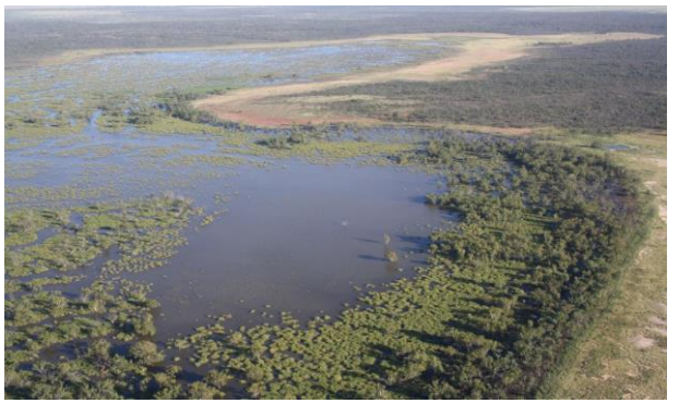
Back Lake and Long Arm (photo taken during scientific monitoring 14 February 2022).

We gratefully acknowledge the contribution of partner agencies NSW Department of Planning and Environment – Environment, Energy and Science, and NPWS in monitoring bird colonies within Dharriwaa (Narran Lakes).