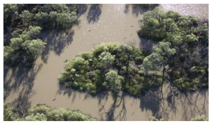
South Arm straw-necked ibis' colony, (photo taken 14 February 2022 during scientific monitoring).

Over 174 GL of water has passed the Wilby Wilby gauge since November and recent inflow of water into Dharriwaa has stabilised water levels which had been rapidly dropping.