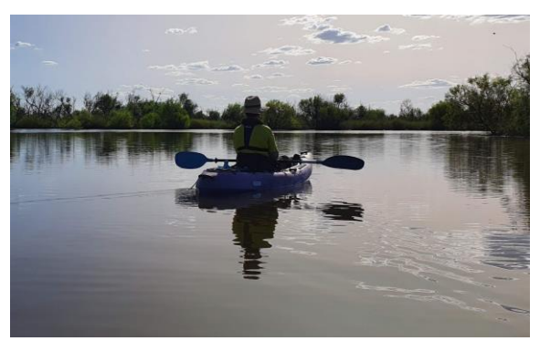
Waterbird monitoring at Dharriwaa, February 2022 (photo taken during scientific monitoring). Image Kate Brandis, UNSW.

The release was due to begin on 24 February, however rainfall in late February changed our plans. Around 500 GL is now expected to flow past St George in Queensland in March. The CEWO has decided not to proceed with the release at this point. The ecological outcomes from current flows are being tracked through waterbird, fish, and vegetation monitoring projects in the Lower Balonne.