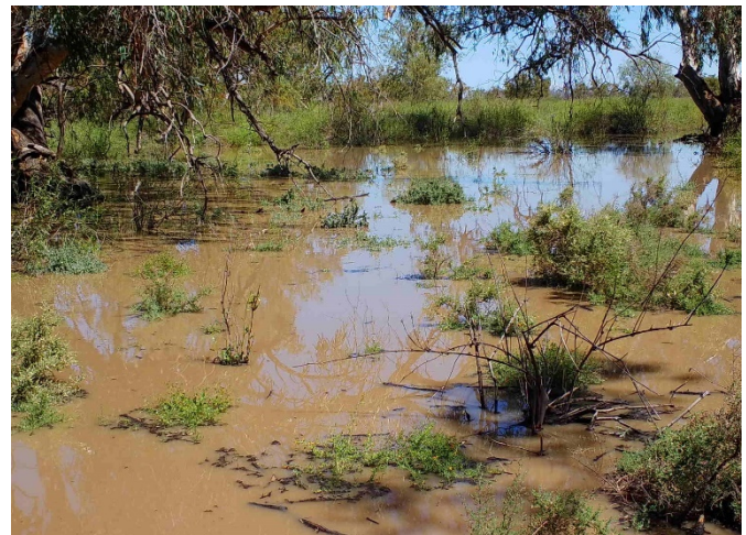
Water gradually spreading through the wetland (CEWO)

Narran Lakes is a renowned haven for birds, with over 100 bird species being recorded there at times. As Clear Lake fills, small wading birds have been seen foraging along its edge, along with herbivorous waterbirds, including swans. Clouds of budgies have also been observed. More waterbirds are expected to appear, in coming weeks.