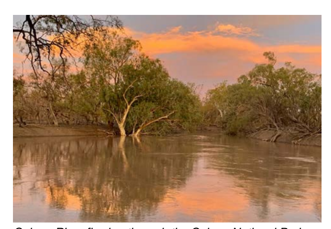
Culgoa River flowing through the Culgoa National Park on 3 March