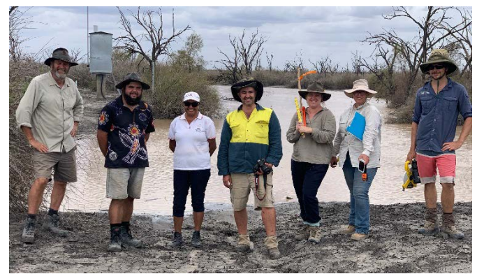
Members of the vegetation monitoring team, Traditional owners, NSW and Commonwealth reps (CEWO)

The fieldwork is also an opportunity for knowledge exchange between researchers, water managers, and Traditional Owners.