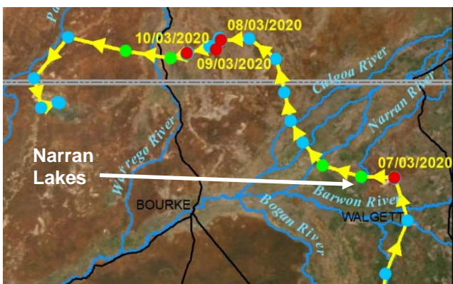
Laurie's travels from 7 March through to 10 March

Laurie has continued west, to the Warrego and Paroo catchments. We will continue to monitor Laurie's movements to see if she returns to Narran Lakes, particularly if waterbirds start breeding there.