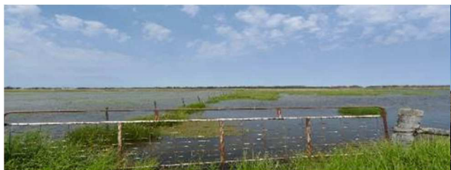
Monkeygar water couch – 2016