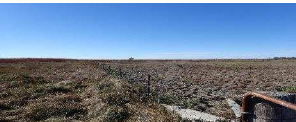
Monkeygar mixed marsh – 2018