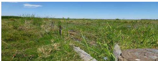
Monkeygar mixed marsh – 2016