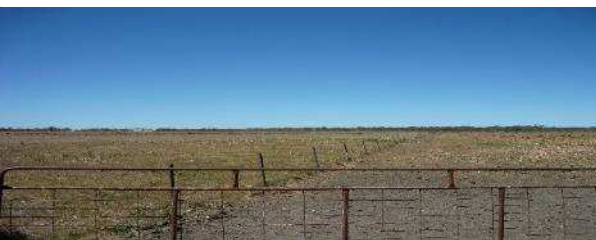
Monkeygar water couch – 2018